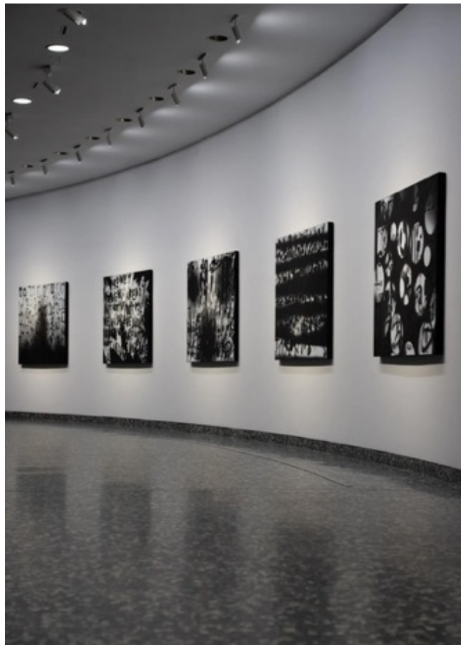
Pendleton’s “Untitled (Days)” series on the walls of the Hirshhorn Museum.

“What I want this work to do is to actually make people more conscious of how they spend their time and what they’re doing with it,” Pendleton said in an interview at the museum in March, as preparations for the show were underway. “And so I hope the exhibition is an opportunity to slow down and actually just, if only for a moment, exists outside of the dynamics or the pressures of any given moment.”