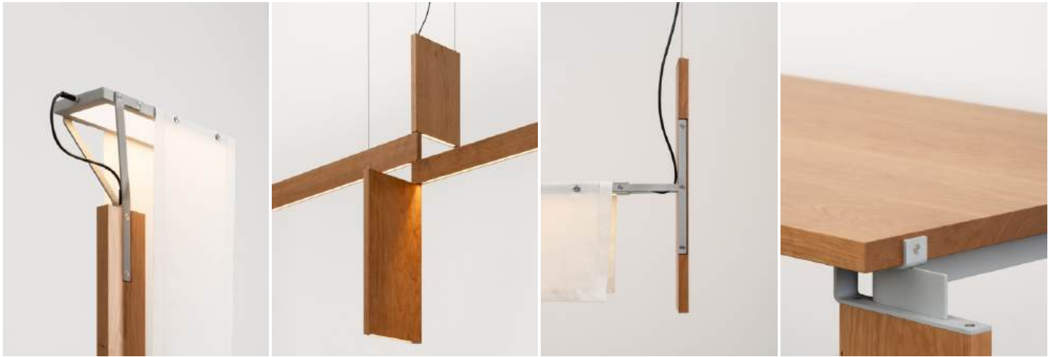
Details of Floor L , Textile , Chandelier , End to End , Table

FRIEDMAN BENDA 515 W 26TH STREET NEW YORK NY 10001