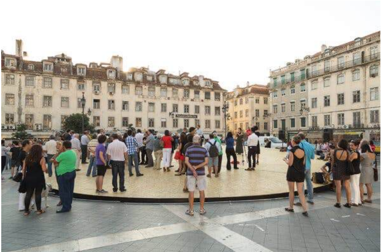
Civic Stage designed by Escobedo for the Lisbon Architecture Triennale, 2013, Lisbon, Portugal, rises higher as the audience grows.

“It was more about the big gesture,” she continued. “What does it say? How do you play with light and these other more simple means to achieve something that feels interesting and engaging?”