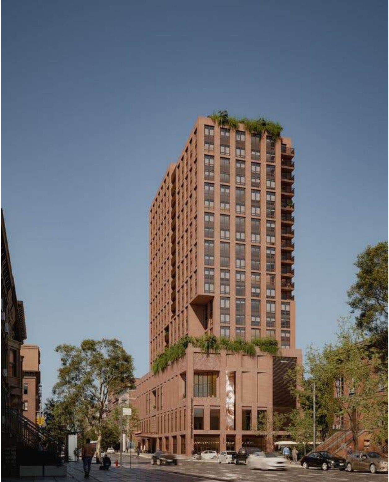
Rendering of the National Black Theater's mixed-use project, Ray Harlem, includes residential, retail and performance spaces. The project is in collaboration with Handel Architects.