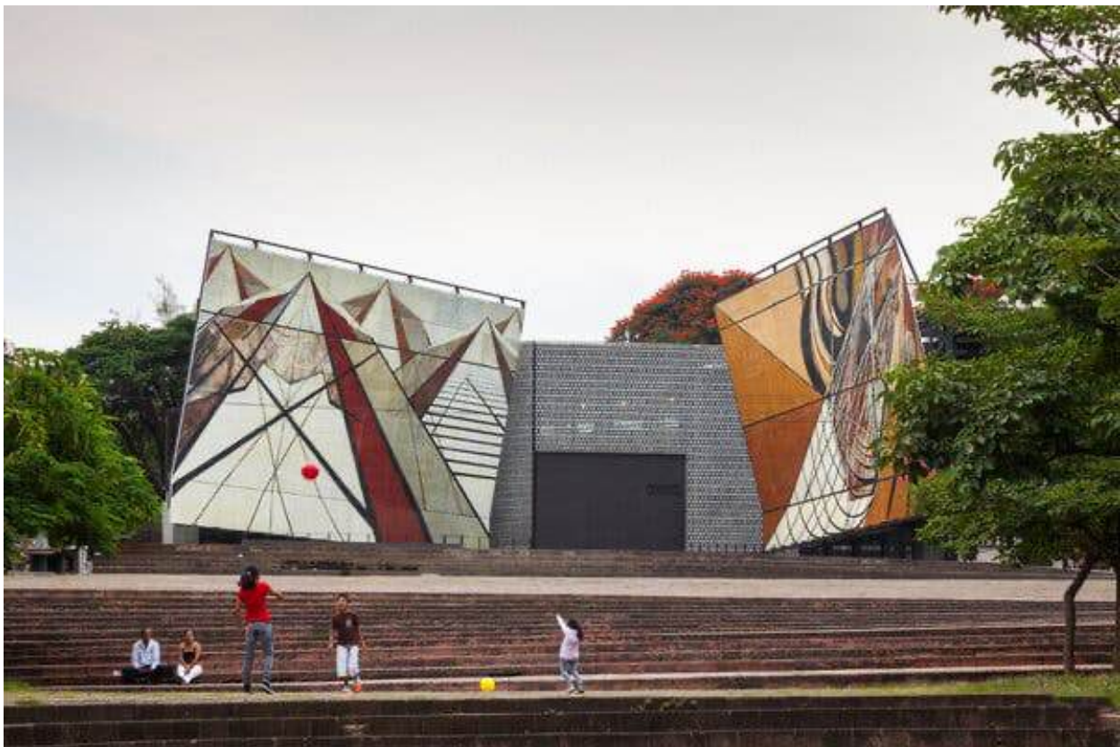
The Escobedo-designed expansion of La Tallera Siqueiros, a museum, workshop and artist’s residence in Cuernavaca, Mexico. The architect opened the museum’s courtyard to the plaza by rotating murals by David Alfaro Siqueiros from their original position, making them part of the facade.

That multidisciplinary sensibility has informed Escobedo’s approach to design. “It’s amazing to talk to an architect who has also an artist mind,” said Petrit Halilaj, the Kosovan artist who created last year’s Met rooftop commission . “You can talk about space or color or love.” Halilaj first met Escobedo at the 2013 Lisbon Architecture Triennale, where she had designed a circular sloping stage that elevates the performer as the audience grows.