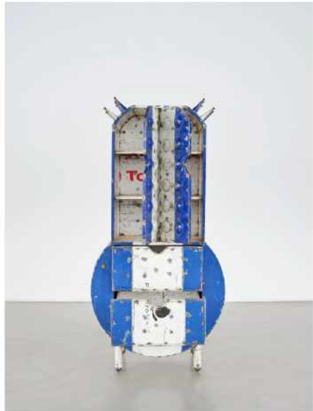
The piece is made from engine oil drums and sheet metal.