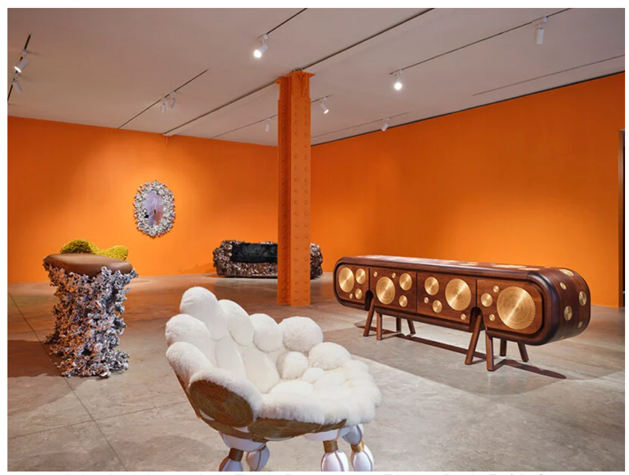
installation view I

On the Road exemplifies Estúdio Campana's signature approach of imbuing everyday materials with a sense of wonder and emotional resonance. Campana explains, 'Since the beginning our work has this connection with spirituality. They are handmade, they are tailoring objects where you put emotion, which is love.' The resulting works are more than just furniture — they are artistic expressions that tell stories and evoke feelings.