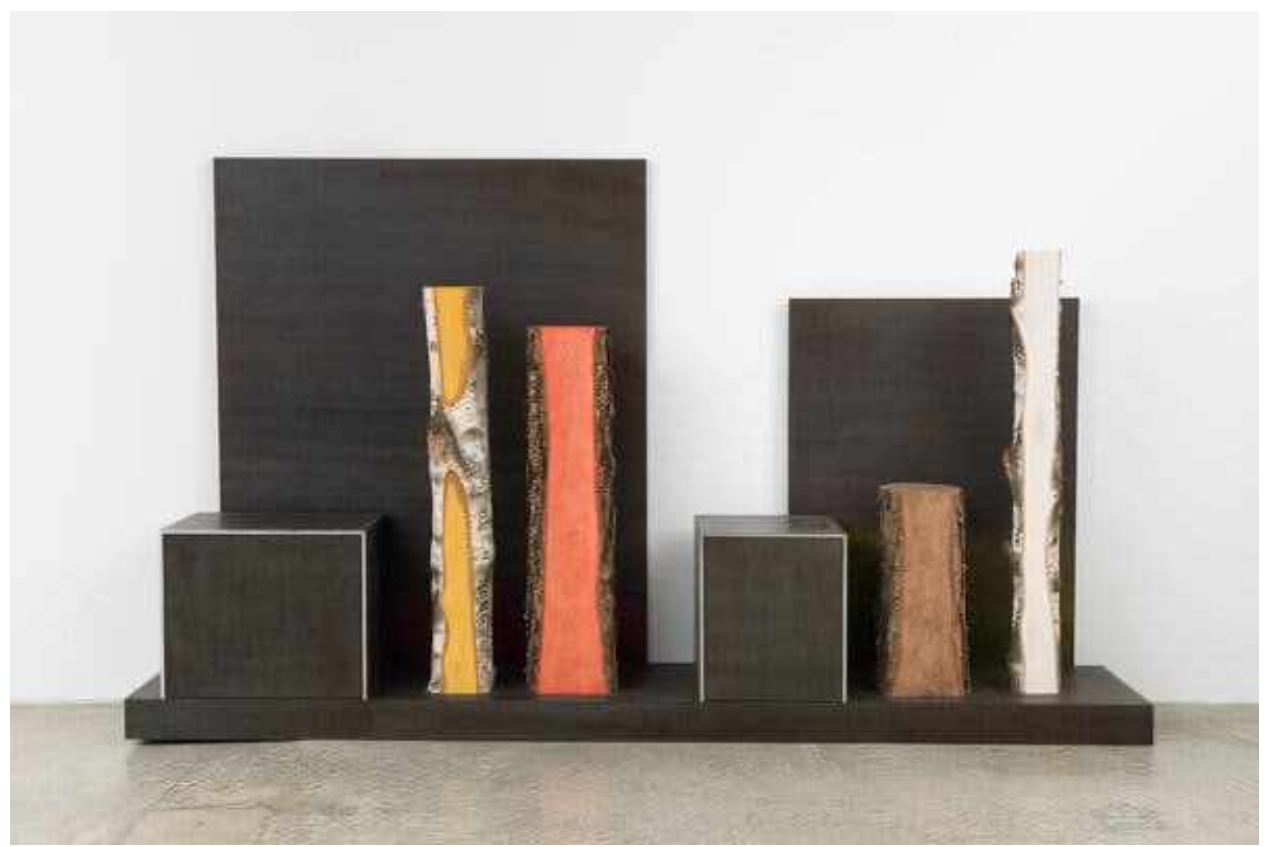
Mr. Branzi used a wide variety of media. His "Plank Cabinet 8" from 2014 is made of patinated and polished aluminum, wood and spray paint.