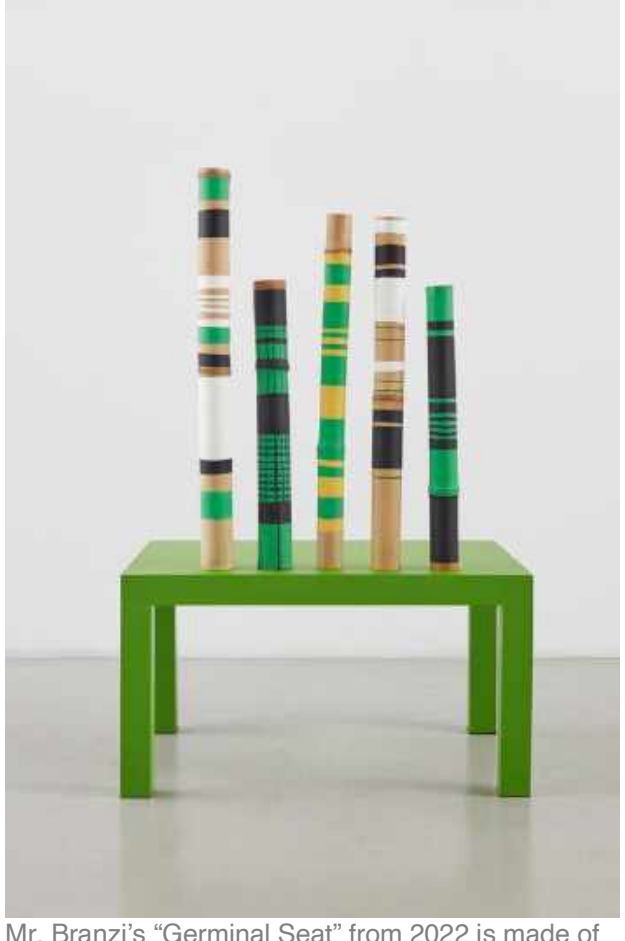
Mr. Branzi's "Germinal Seat" from 2022 is made of hand-painted bamboo and painted aluminum.