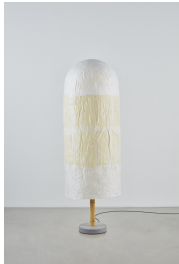
Andrea Branzi [Italian, b. 1938] Lamp , 2014 Japanese rice paper, bamboo, Belgian Bluestone 93.75 x 30 x 30 inches 238 x 76 x 76 cm Edition of 12 Inv# FB36861