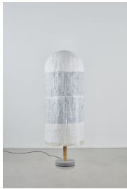
Andrea Branzi [Italian, b. 1938] Lamp , 2014 Japanese rice paper, bamboo, Belgian Bluestone 88 x 30 x 30 inches 224 x 76 x 76 cm Edition of 12 Inv# FB36858