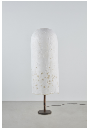
Andrea Branzi [Italian, b. 1938] Lamp (Maple Leaves) , 2022 Japanese rice paper, maple leaves, patinated aluminum and black bamboo 96 x 30 x 30 inches 244 x 76 x 76 cm Edition of 12 Inv# FB37356