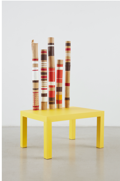
Germinal Seats , 2022