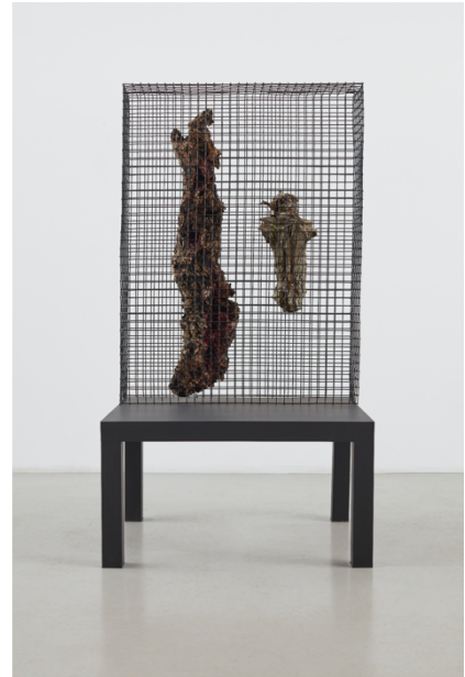
Roots , 2022

Opening Reception: Thursday, March 2 nd , 6-8 pm