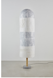
Andrea Branzi [Italian, b. 1938] Lamp , 2014 Japanese rice paper, bamboo, Belgian Bluestone 108.25 x 27.75 x 27.75 inches 275 x 71 x 71 cm Edition of 12 Inv# FB32806