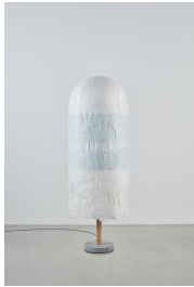
Andrea Branzi [Italian, b. 1938] Lamp , 2014 Japanese rice paper, bamboo, marble 88 x 30 x 30 inches 224 x 76 x 76 cm Edition of 12 Inv# FB38599