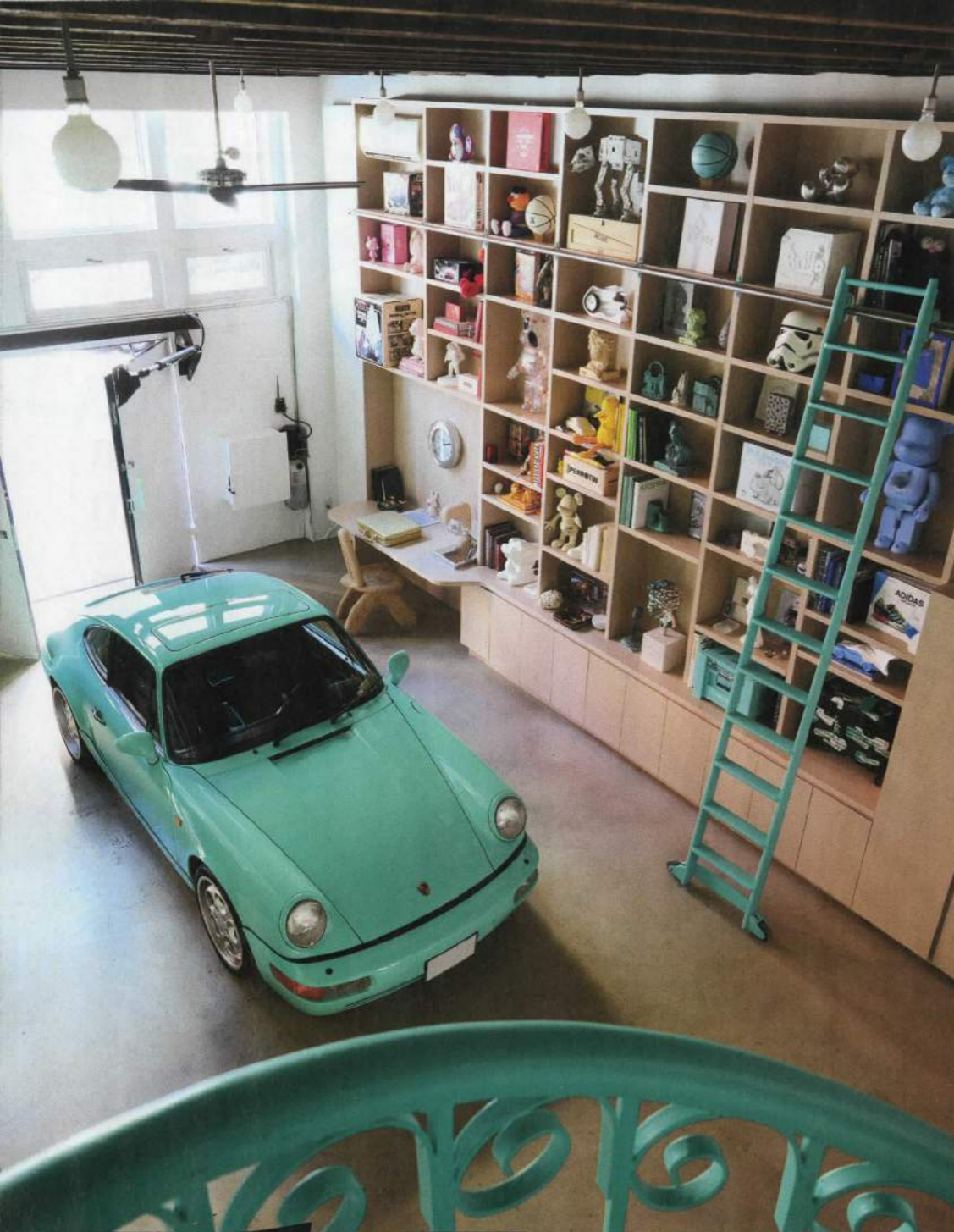
LEFT A MINT GREEN 1991 PORSCHE 964 CARRERA 2 IS PARKED IN THE HOME STUDIO/GARAGE. OPPOSITE DANIEL ARSHAM STANDS NEXT TO THE FIREHOUSE'S ORIGINAL CAST-IRON SPIRAL STAIRCASE, WHICH IS NOW PAINTED IN ARSHAM GREEN. ARSHAM PIECES INCLUDE FALLING CLOCK ABOVE A SNARKITECTURE X GUFRAM BROKEN MIRROR AND R2-D2 CRYSTALLIZED RELIC STATUE, AND THE TWO WORKS ON THE WALL.