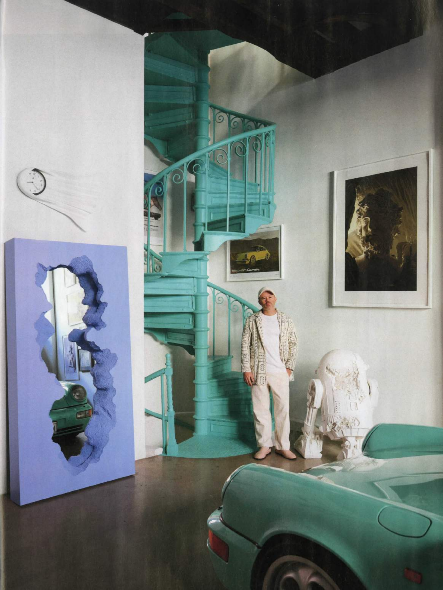
ART: DANIEL ARSHAM.

City studio every day so, he stresses, “the car is really important to me. I’m very particular, and the garage needs to be clean and protected.” Quite a tall order for NYC housing no matter the borough, but during the summer of 2022 it all clicked.