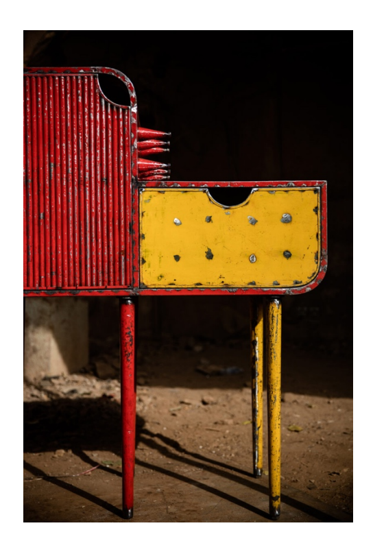
Beall, Kelly "Hamed Ouattara's Bolibana Reimagines Disposability + Possibility." 9 September 2023. Design Milk .