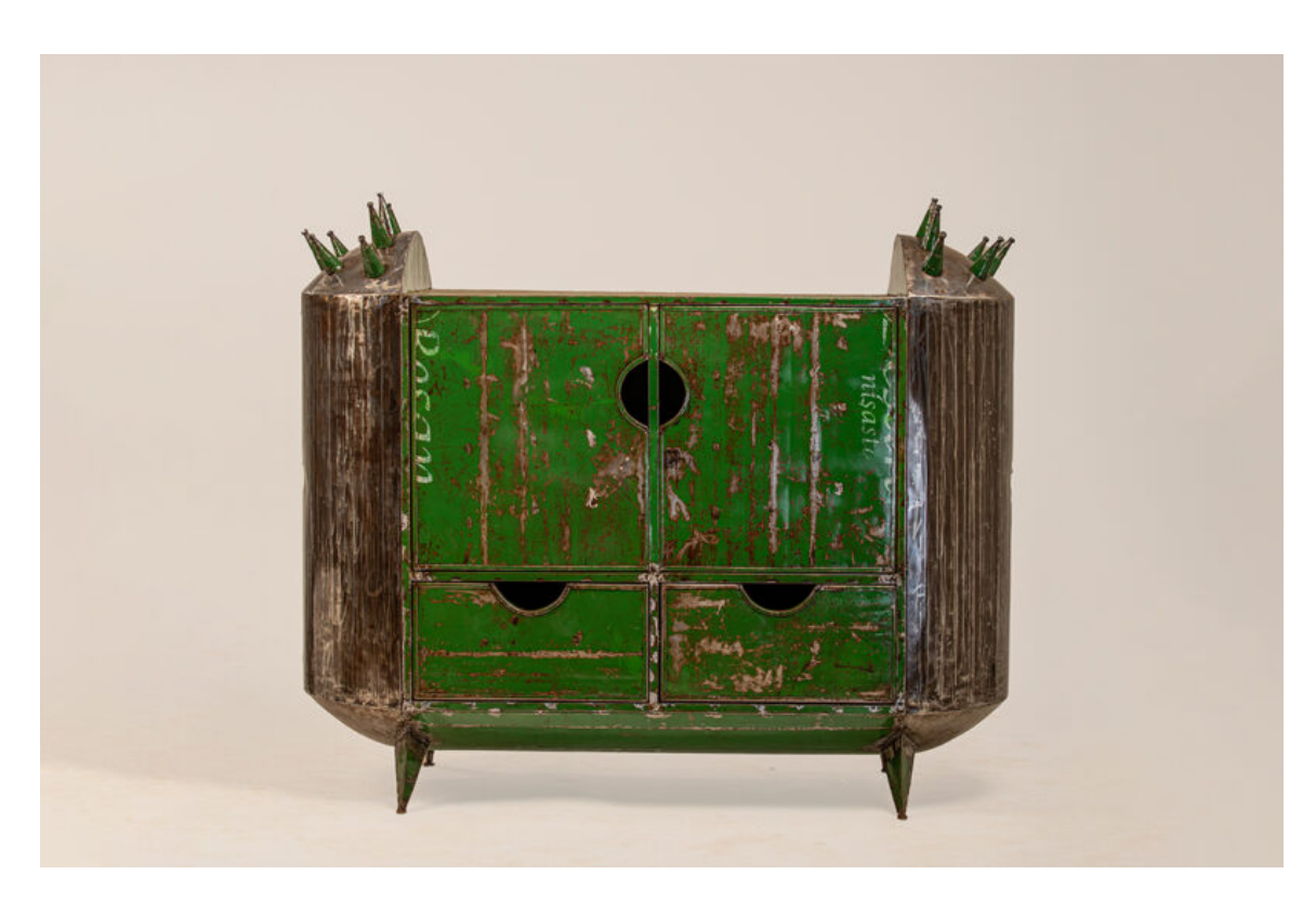
Djeli (Tradition Teller)