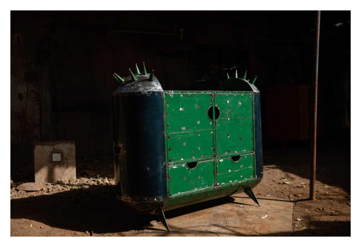
Beall, Kelly "Hamed Ouattara's Bolibana Reimagines Disposability + Possibility." 9 September 2023. Design Milk .