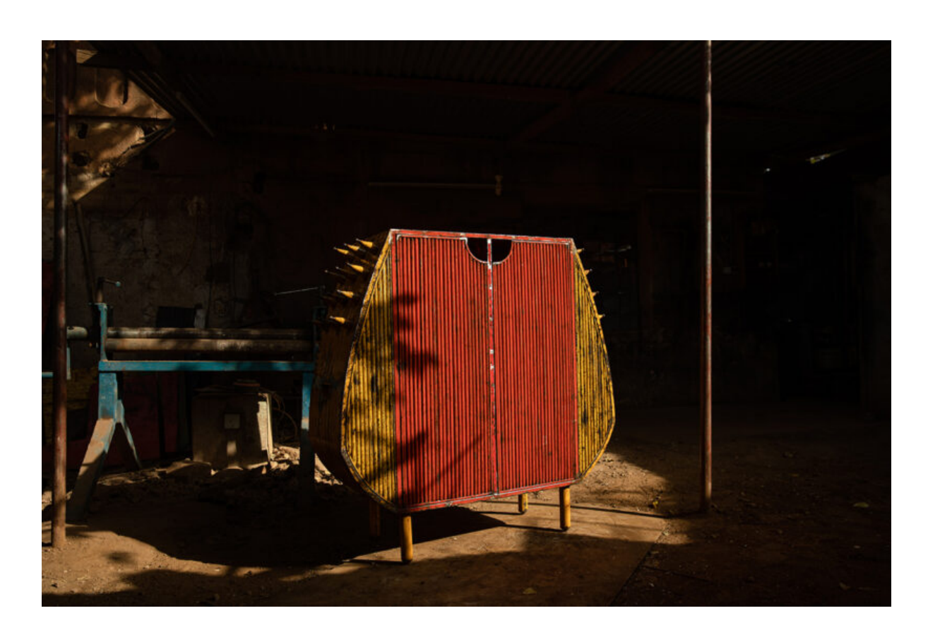
Beall, Kelly "Hamed Ouattara's Bolibana Reimagines Disposability + Possibility." 9 September 2023. Design Milk .