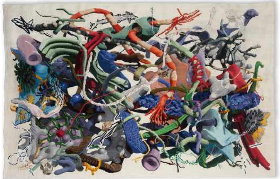
Swatching Space Time, 2023

Opening Reception: Saturday, April 29 th , 2 – 5pm