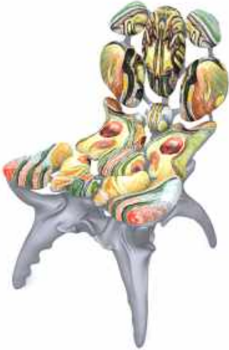
The Ever Sessile Pupa [drawing], 2022