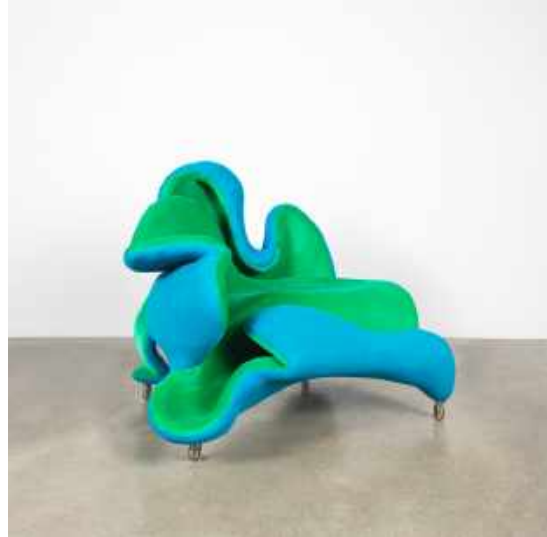
Ammonoid Beta, 2020