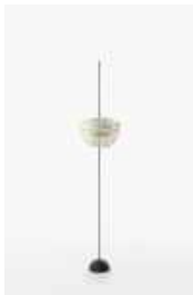
nendo [Established, Tokyo, 2002] hyouri after: A, 2021 Bamboo, Washi paper 82.75 x 16.5 x 16.5 inches 210 x 42 x 42 cm Edition of 8