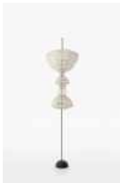
nendo [Established, Tokyo, 2002] hyouri before: B, 2021 Bamboo, Washi paper 82.75 x 22 x 22 inches 210 x 56 x 56 cm Edition of 8