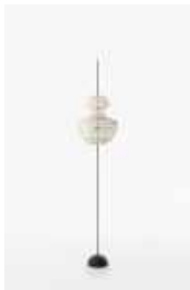
nendo [Established, Tokyo, 2002] hyouri before: A, 2021 Bamboo, Washi paper 82.75 x 16.5 x 16.5 inches 210 x 42 x 42 cm Edition of 8