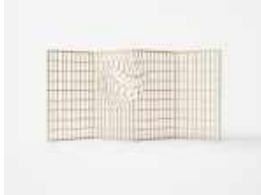
nendo [Established, Tokyo, 2002] fuu-raijin [Left Part], 2021 Japanese Cypress 62.75 x 119.5 x 18.25 inches 159.5 x 303.2 x 46.5 cm Unique