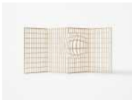
nendo [Established, Tokyo, 2002] fuu-raijin [Right Part], 2021 Japanese Cypress 62.75 x 119.5 x 18.25 inches 159.5 x 303.2 x 46.5 cm Unique