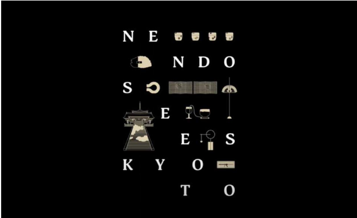
NENDO SEES KYOTO exhibition illustration