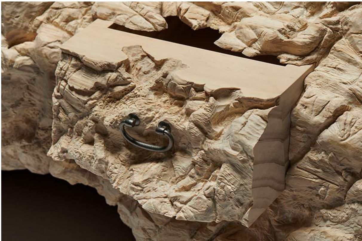
the stone-like wooden piece incorporates a drawer