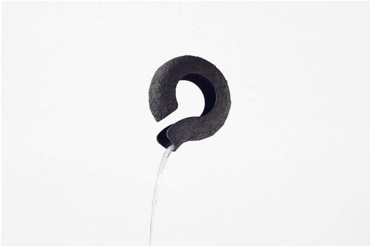
the vessel combines old and new metal processing technologies