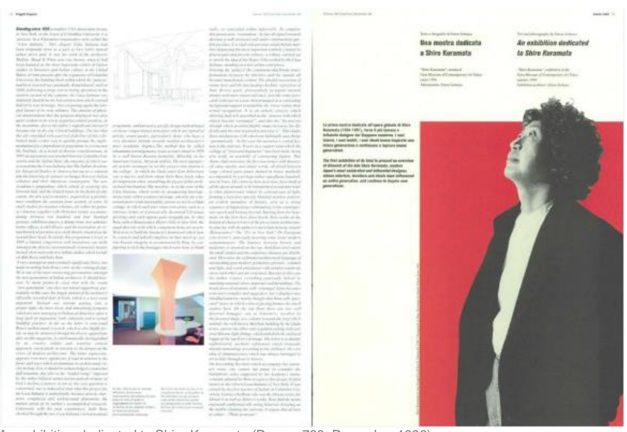
An exhibition dedicated to Shiro Kuramata (Domus 788, December 1996)

This is why Shiro Kuramata's legacy is not just in that little or nothing that is left of what he constructed, but in his capacity to imagine spaces where transparency and forms belonged to no particular place. Yet as he himself said, "But they exist!"