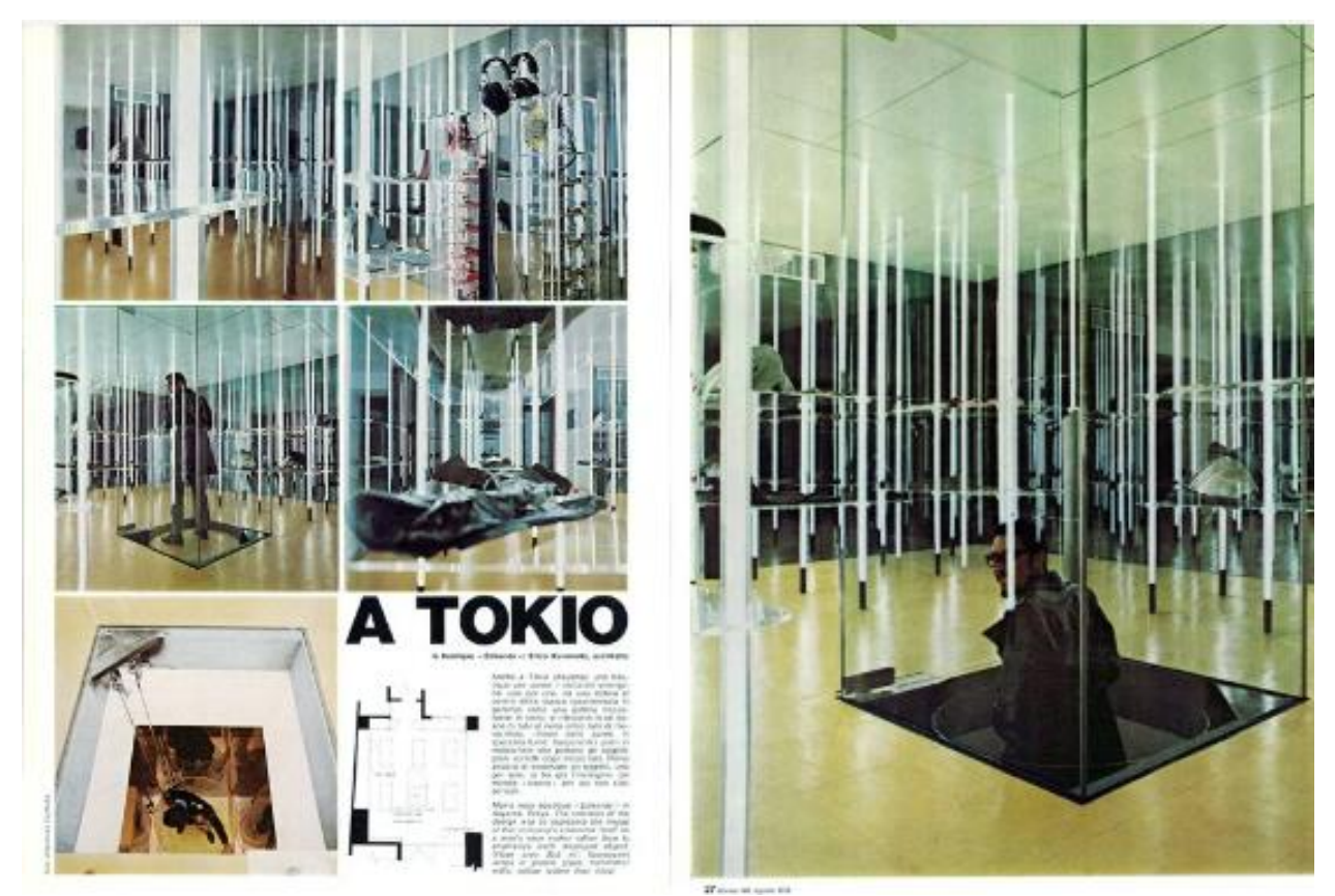
Shiro Kuramata: due negozi a Tokyo, Domus 489, dicembre 1970

Although he died prematurely in the early 1990s, Shiro Kuramata made an indelible mark on the world of design, leaving a legacy in work that is at once eloquent and ephemeral. What Kuramata imagined was not simply a life made up of spaces and objects constructed out of the same impalpable stuff as dreams, but a world of unexpected relationships, spaces designed not with material but with magical metaphors and ever-new ideas. With transparency and colour, he produced a displacement of meaning that scored into the relationship between human being and material (increasingly impalpable as his career progressed), tapping into the energies of a society undergoing profound change.