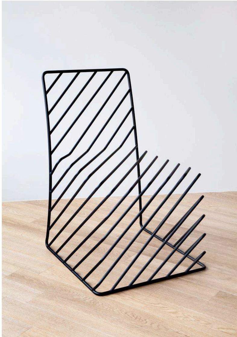
CHAIR APPARENT | A piece by Oki Sato of Nendo, part of a solo exhibition, 'Thin Black Lines,' that debuted at London's Saatchi Gallery in 2010.

Less is more for the prolific designer behind Japanese design studio Nendo, whose distinguished minimal aesthetic remains the DNA of his latest works to be shown in several upcoming exhibitions