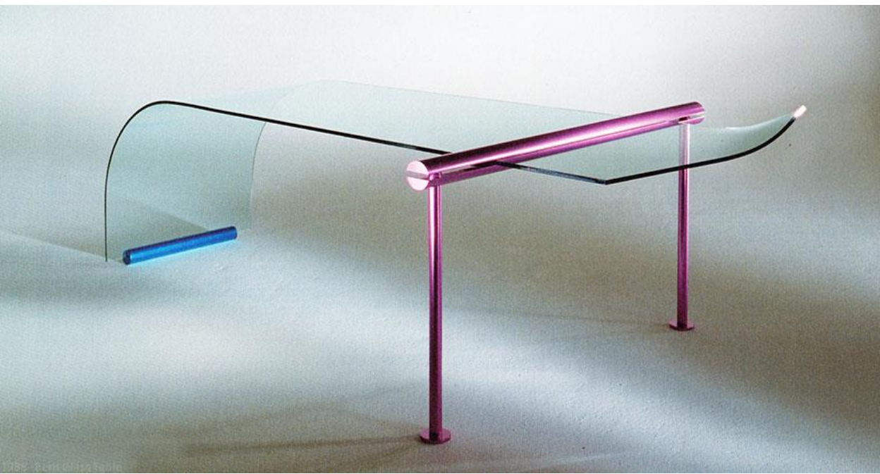
The Bent Glass table (1988)