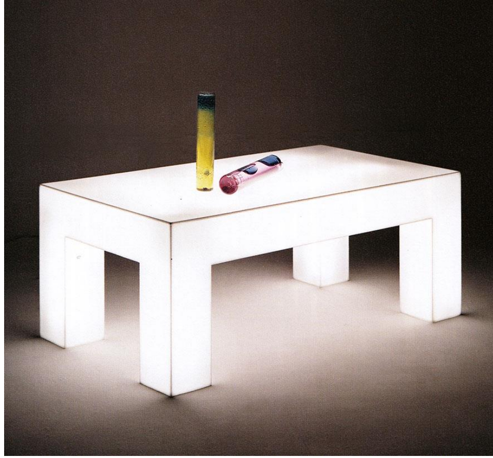
The Luminous table (1969)