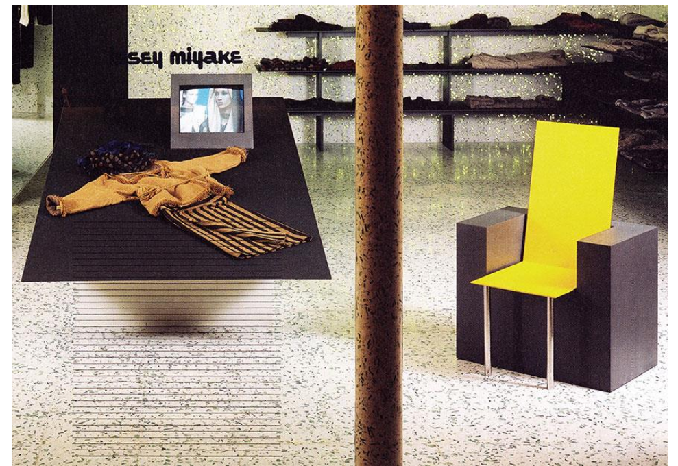
Kuramata's 1984 interior for the Issey Miyake store in Bergdorf Goodman, in New York City