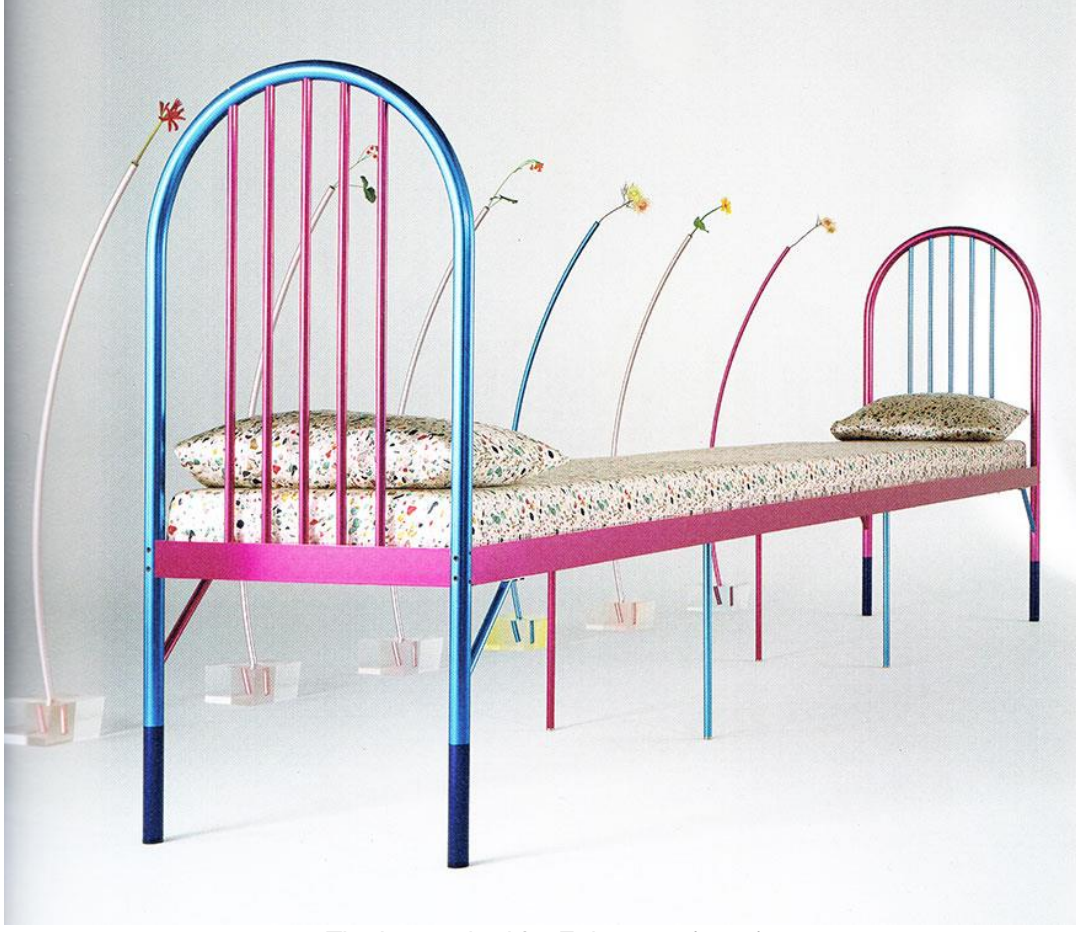
The Laputa bed for Ephemera (1989)