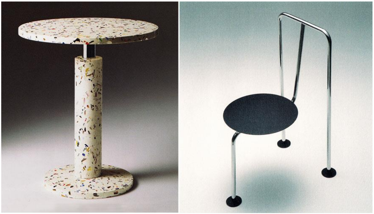
Left: the Kyoto table (1983). Right: a Kuramata chair circa 1983-84