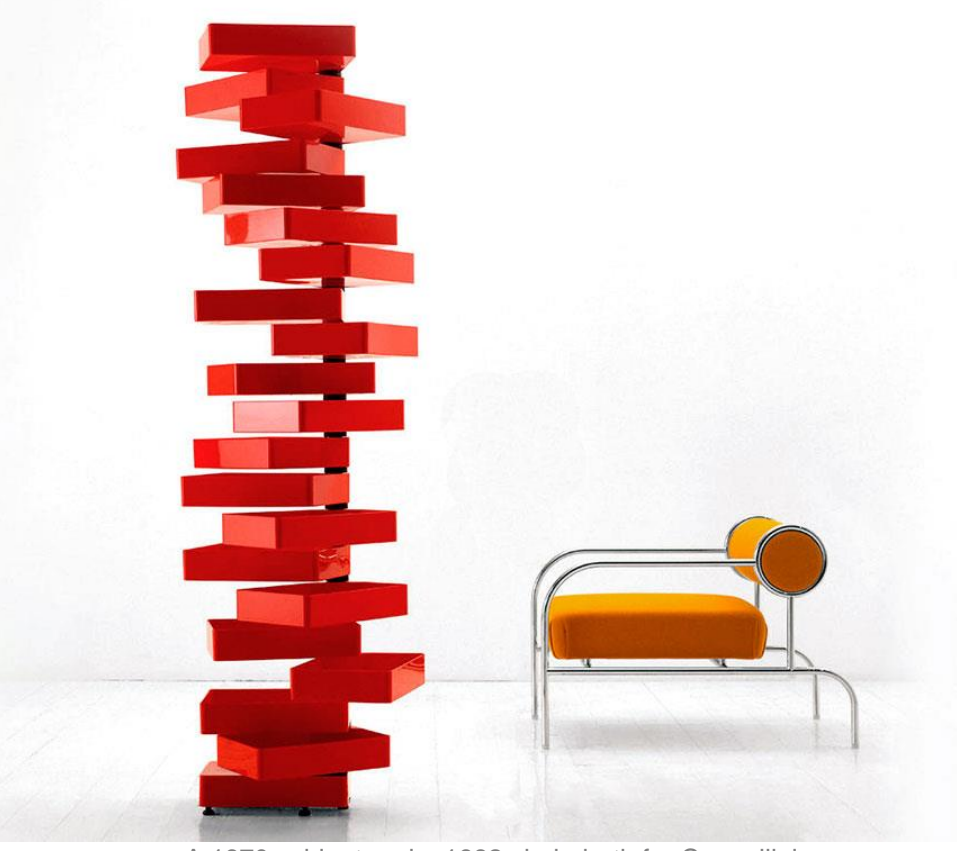
A 1970 cabinet and a 1982 chair, both for Cappellini