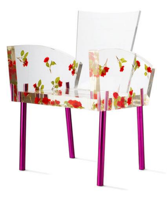
The Miss Blanche chair (1988)

You have to dream intentionally. Most people dream a dream when they are asleep. But to be a writer, you have to dream while you are awake, intentionally."