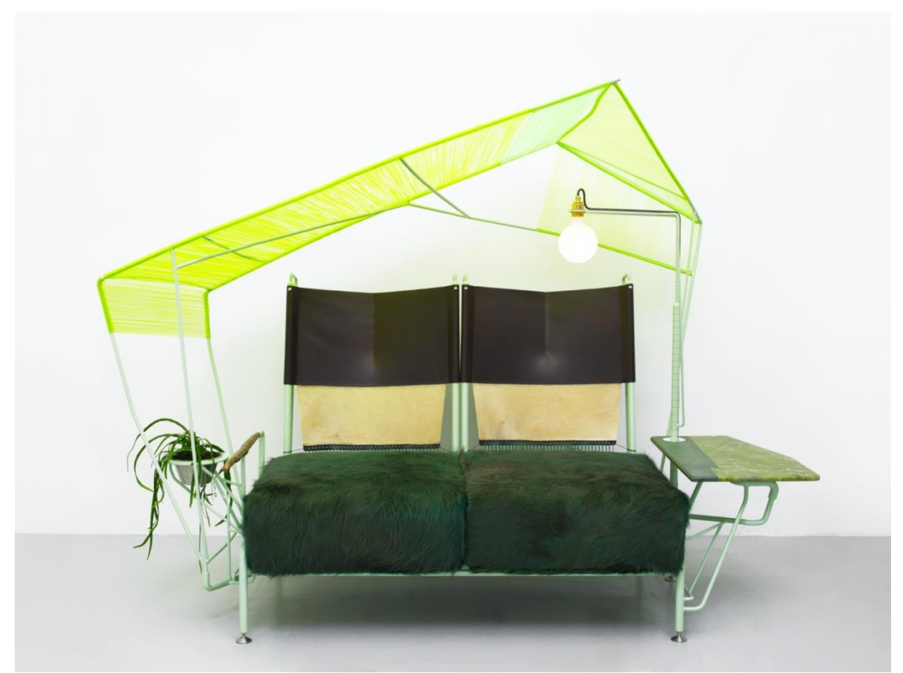
Jonathan Trayte, Grass Green Settee (2020): Powder-coated steel, stainless steel, bronze, marble, polymer compound, pigments, reinforced plastics, crushed glass, animal hide, upholstery, light-fitting.

artificial, constructed or grown, and whether these bifurcations are in fact meaningful at all.