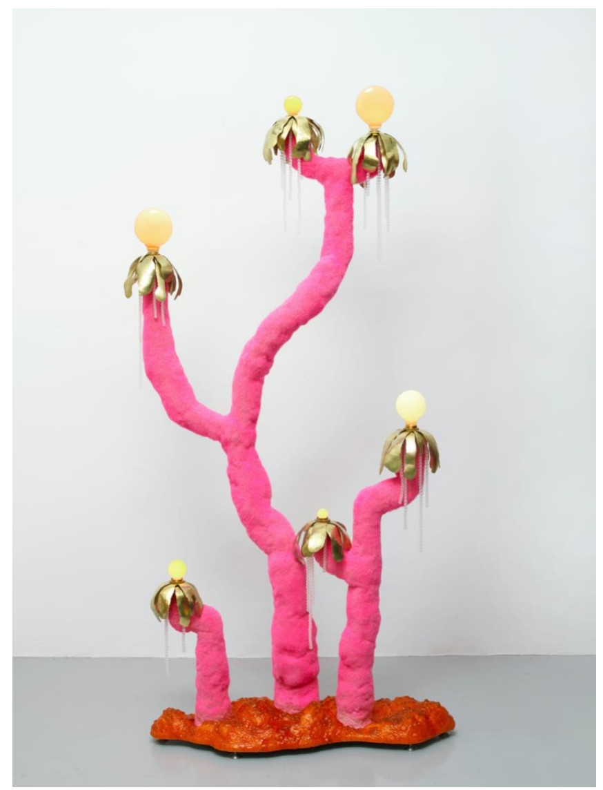
Jonathan Trayte, Pink Hot Solar Buzzer (2) (2019): Stainless steel, polymer compound, reinforced plastic, pigments, glass, nylon flock, brass, light fitting.

Once we get used to seeing steel benches made a certain way, we begin to feel that something is unnatural about a bench made differently. Likewise, machine reproduction has conditioned us to instinctively categorize organic, undisciplined shapes as natural — but if we look more closely we find that this guidance is faulty. Joshua trees, the real ones, aren't any less disorientingly composed than Trayte's representations — they burst into sudden foliage at their tips and their thick hairy limbs grow, improbably, from similarly thick hairy trunks. Their silhouettes are clear, as though drawn by sharpie — and they waste no energy on twigs and small exploratory branches. Gaudí said, "There are no straight lines or sharp corners in nature." But that was true only until nature produced humans. Trayte's work suggests that the anthropocene is no less artificial than previous epochs — that trees and hollows, the furniture of wildlife — is not so distant from even the most quixotic of our domestic contrivances.