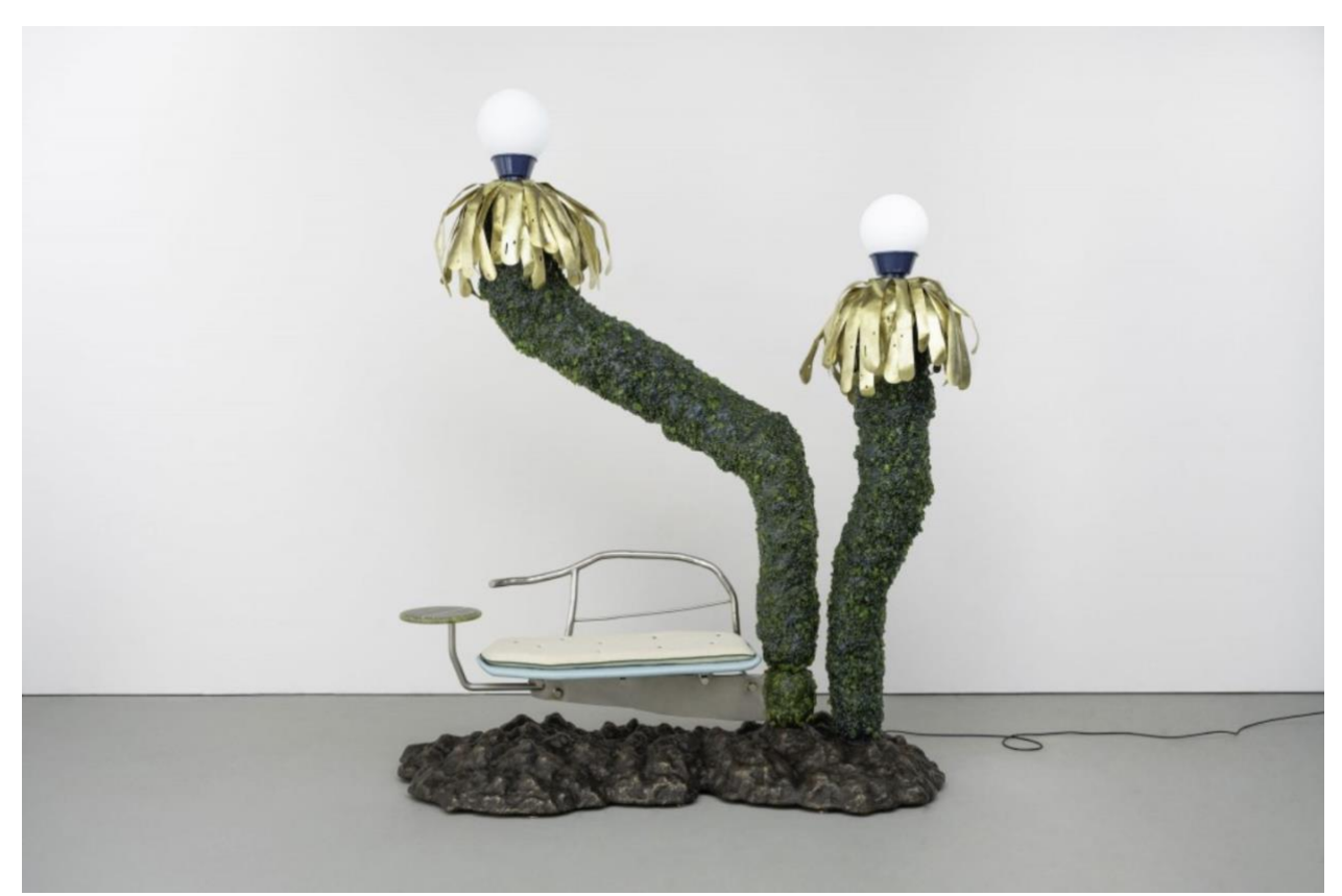
Jonathan Trayte, Atomic Double (2020): Bronze, stainless steel, brass, aluminum, reinforced plastics, crushed and blown glass, marble, light fittings, upholstery.

Juxtapositions of color, texture, and reflectivity play up the festive friendliness of Trayte's compositions. But the easy appeal of his functional sculptures belies their complexity. Trayte's eclecticism frequently complicates the assumed differences between his materials.