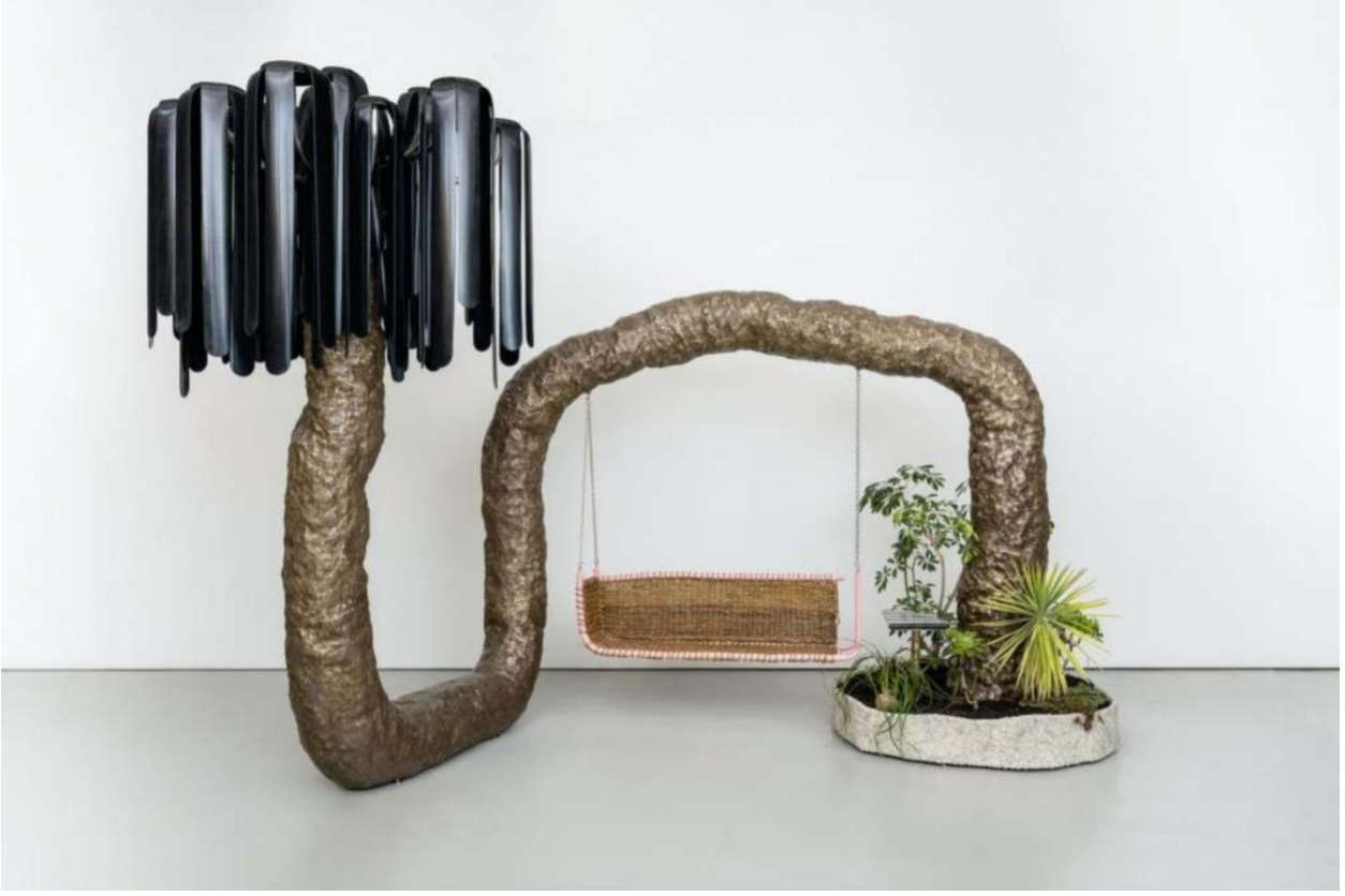
Jonathan Trayte, Sundown Swing (2020): Bronze, stainless steel, powder coated stainless steel, reinforced plastics, crushed glass, granite, basalt, marble, wicker, rubber.

By Brecht Gander Wright February 16, 2021