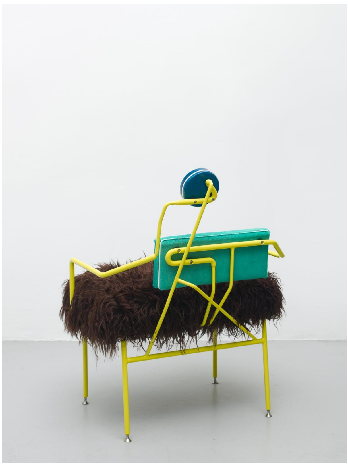
Jonathan Trayte, bONZA (2019): Powder-coated steel, stainless steel, birch plywood, upholstery, animal hide.