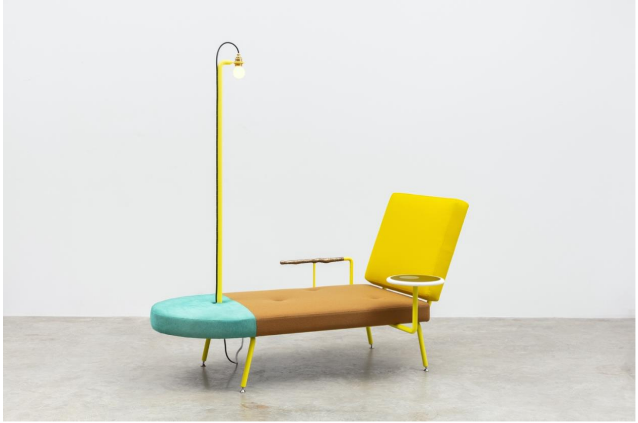
Jonathan Tratye, Mint Rola and Lamp (2018): Powder-coated steel, stainless steel, bronze, marble, granite, birch plywood, animal hide, fabrics, upholstery, light fitting.

The presence of choice is constantly highlighted in Trayte's work — which brings into focus a thousand instances of decision. Whereas the form of say, a Henry Moore sculpture might attain a certain cohesion and be approached as a dynamic monolith, Trayte's work is legibly tweaked, altered, and revised and the connections between each impulse is painstakingly detailed. A leg becomes an arm becomes a headrest — and these transitions are performed in public (see bONZA, 2020). Sometimes we can see the joining screws, bolts, and brackets — sometimes there is no evidence of how the work has been put together. The result of making in this way, in which there are no clear principles the artist obeys regarding constructive methods, is that each individual moment is blistering with choice and no form develops the feeling of inevitability that artists of cohesion pursue. Trayte's works are accretions of decisions and contingencies, just as trees are inflected by the varying conditions of soil, light, and rain — continually adapting their strategies for growth.