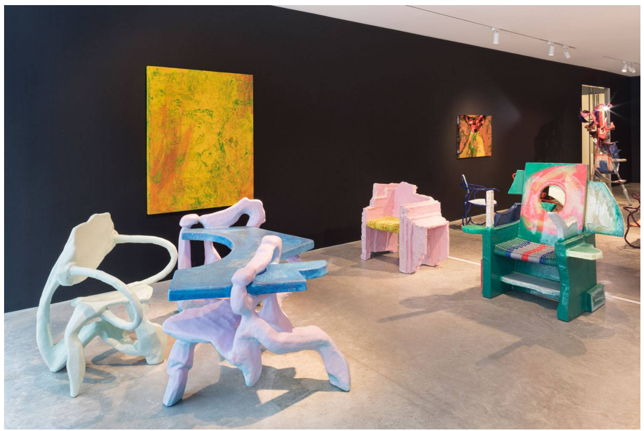
"OrtaMiklos: 6 acts of confinement" at Friedman Benda.

Open interpretation: With imaginative pieces ranging from TV stands to cocktail tables and even lamps, the duo seeks to introduce an abstracted language into the design scene, particularly during the pandemic.