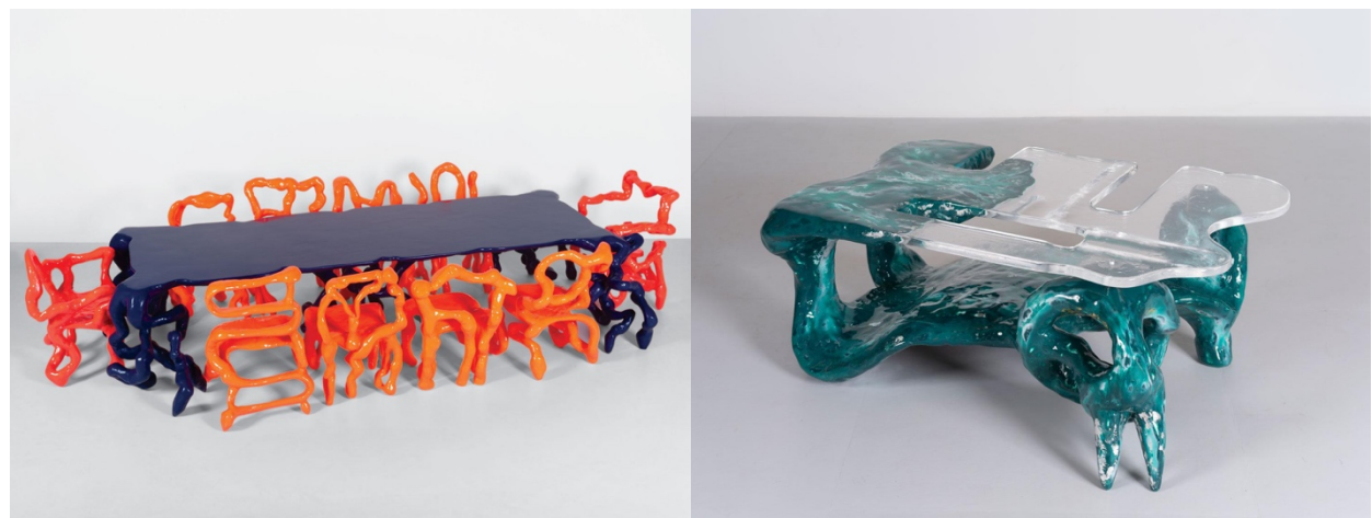
Sunset Phenomena dining table and chairs. Cobra Fever coffee table.

Lockdown mode: When the COVID-19 crisis started in France, the designers invited their team to isolate with them in their cavernous workshop, located in a former mill in Boissy-le-Châtel. "We used what we had in house," recalls Orta. "Nothing was outsourced." Among the materials available were polished iron blocks, discarded wood, cardboard, and fiberglass. "We got to dive deep into developing our own techniques and experimented in a lot of new directions," adds Miklos.