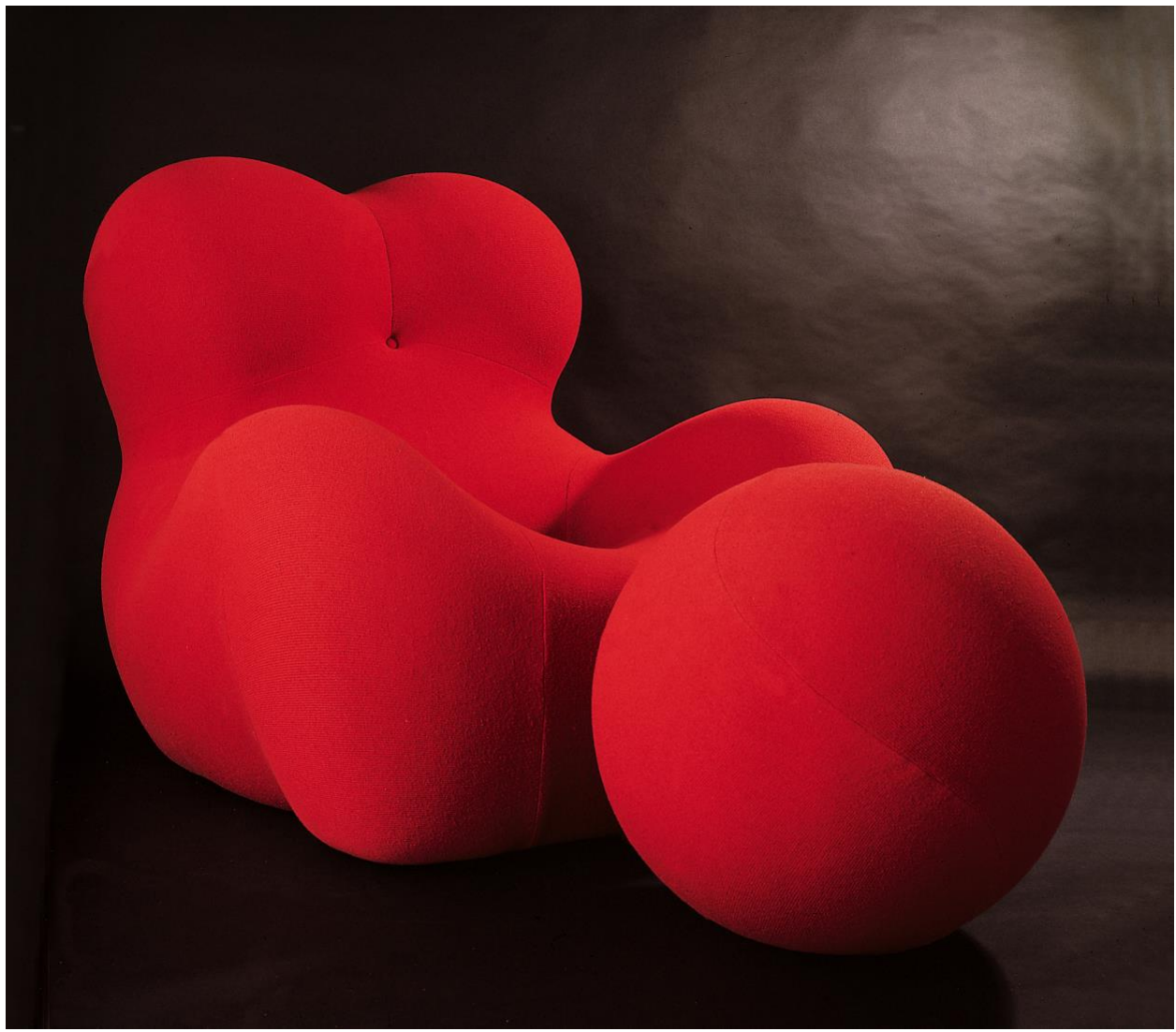
Gaetano Pesce's Up5 chair and Up6 ottoman were intended to represent the lack of freedom of women in society

Pesce imbued many of these projects with religious meaning or political commentary, such as his iconic 1969 Up series of chairs for Italian furniture brand <u>B&B Italia</u>, which was at the time called C&B Italia.