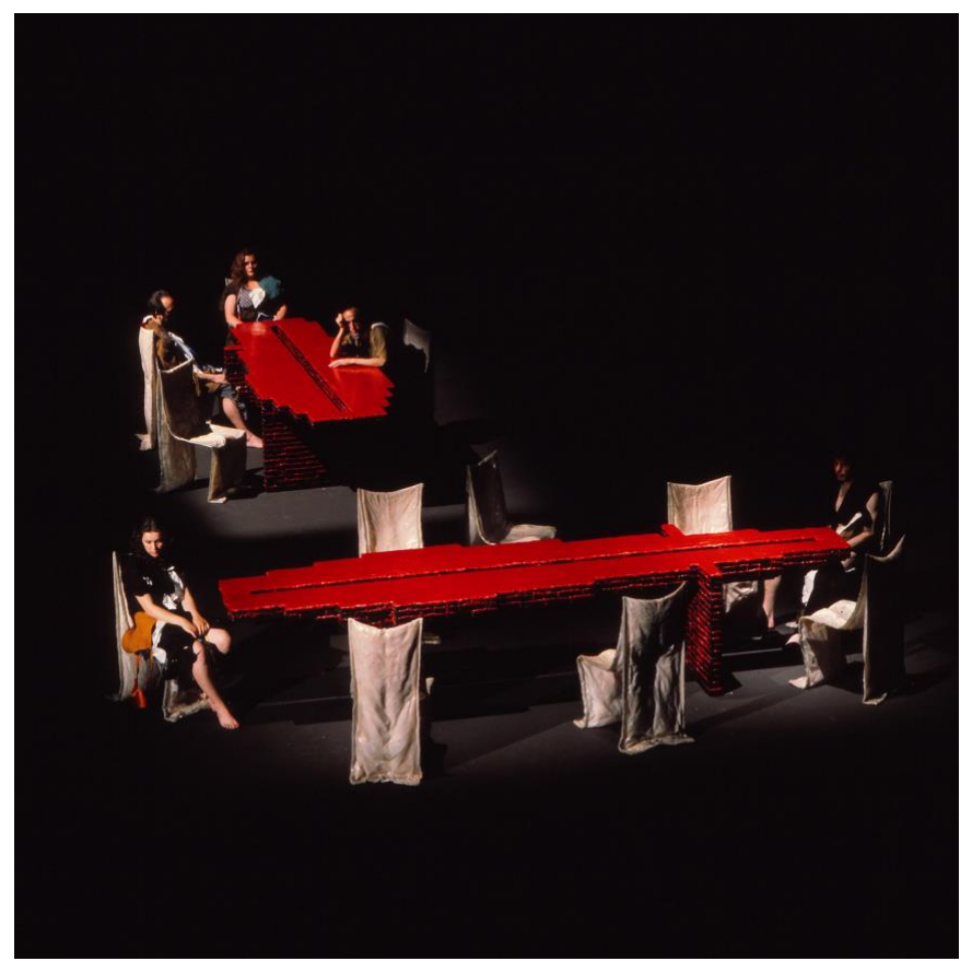
Pesce described his Golgotha table and chairs as representations of the resurrection

"That is a representation of the resurrection," said Pesce. "In my opinion, this is one of the strongest objects I have made. I made this story because I believe design, as an artistic expression, can talk about different concepts and also about religion."