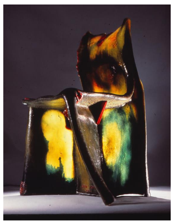
Pesce's Pratt series of chairs were made from different formulations of urethane resin

Pesce adjusted the density of the resin in the chairs, with each chair in the series being sturdier than the one before it. The first chair could not even support its own weight and collapsed as soon as it was removed from its mould. But from the fourth version onwards the chairs could support the weight of a person, becoming sturdier and more functional with each iteration.