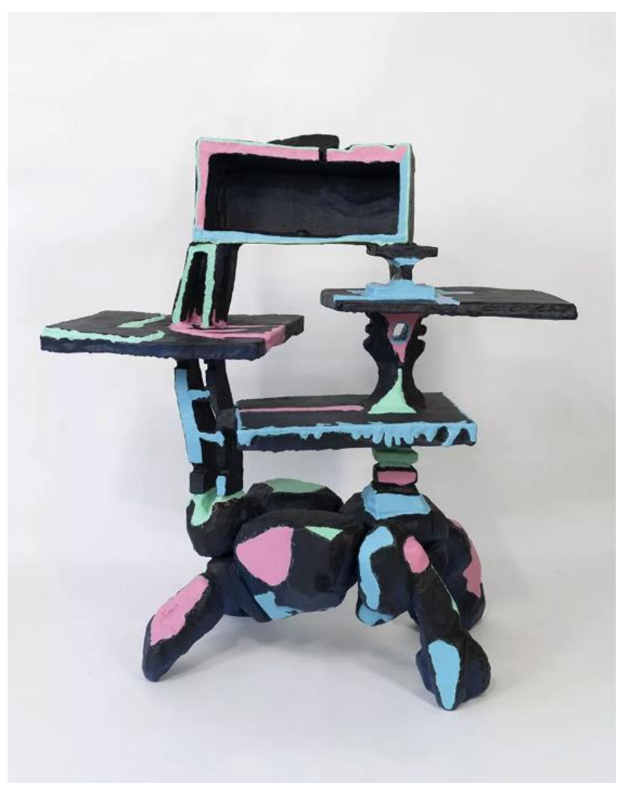
Shelving World-Tortoise, 2020. Polystyrene foam, wood, fiberglass, polyester resin, paint, varnish