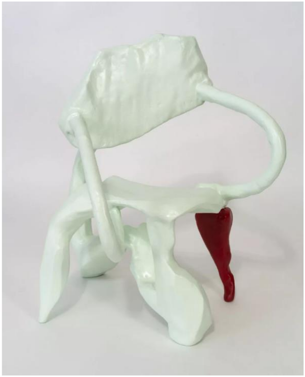
Chair Deer-in-Residence , 2020. Styrofoam, steel, fiberglass, polyester