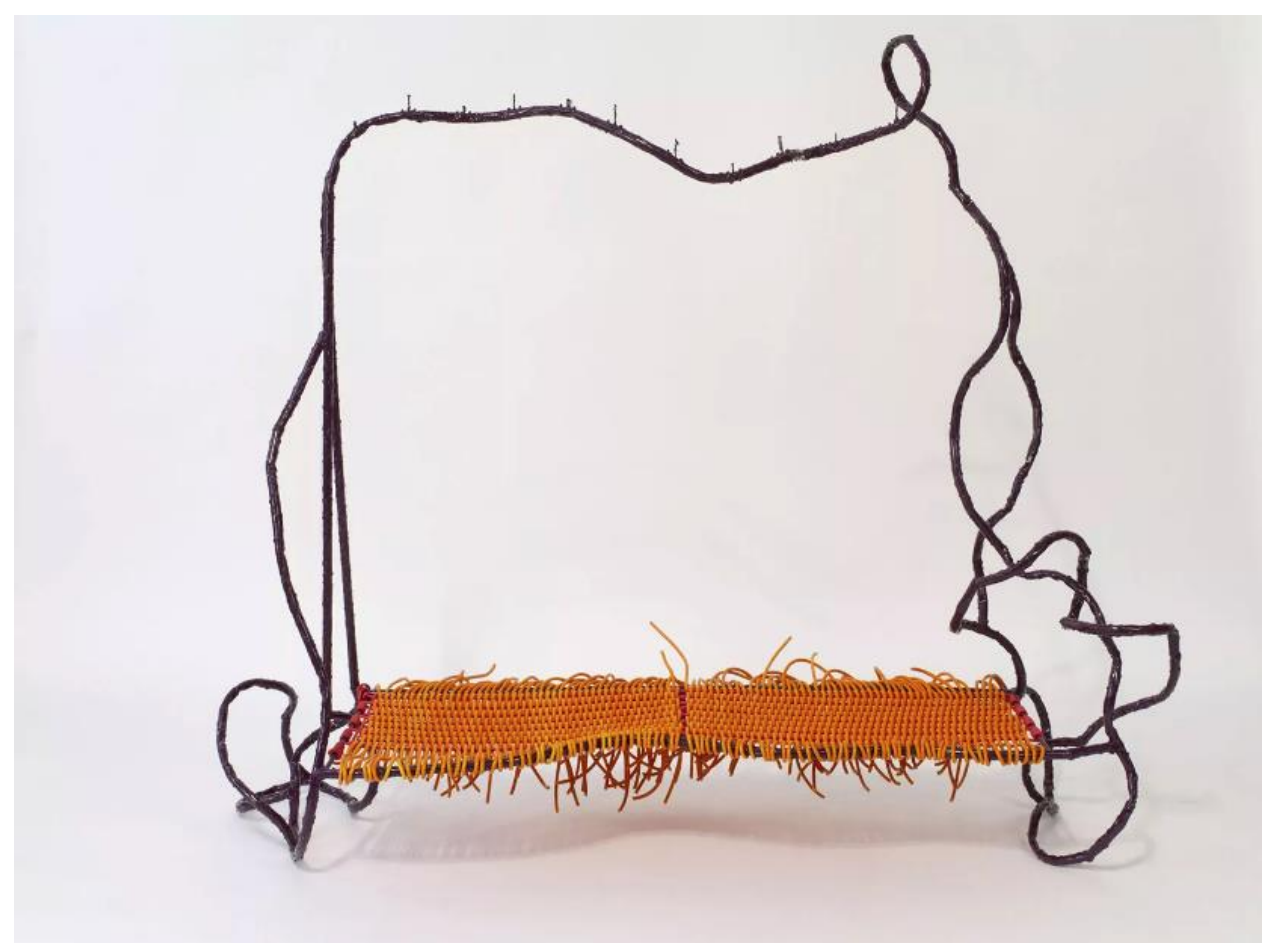
Combined bench and clothes hanger Rugrat Coat Rack, 2020. Steel, powder coated, electrical wires