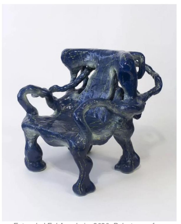
Entangled Eel Armchair , 2020. Polystyrene foam, steel, fiberglass, polyester resin, paint, varnish