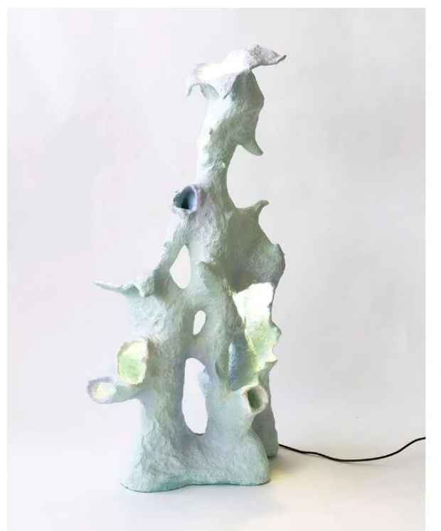
Blue Haliclona Sponge from the Coral Floor Lamp series, 2020. Metal mesh, steel, wood, fiberglass, polyester, cellulose, paint, varnish, lighting fixtures