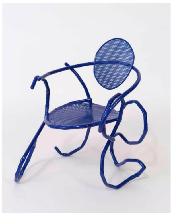
Armchair Melting Thonet , 2020. Steel, powder coated