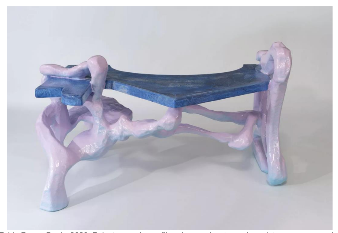
Table Power Desk, 2020. Polystyrene foam, fiberglass, polyester resin, paints, crayons, varnish