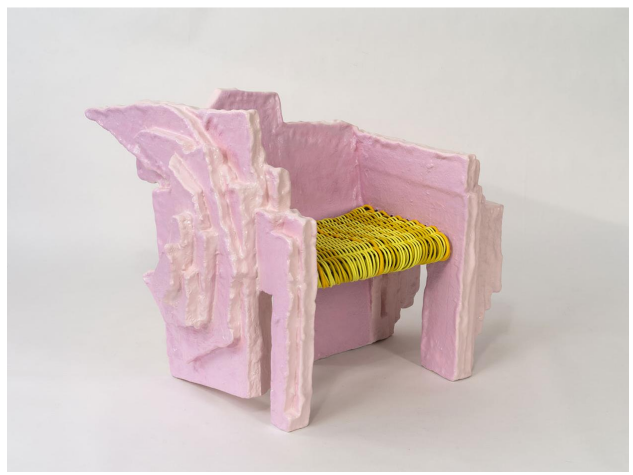
Chair Doggy Caddy Chair, 2020. Polystyrene foam, wood, fiberglass, polyester resin, paint, varnish