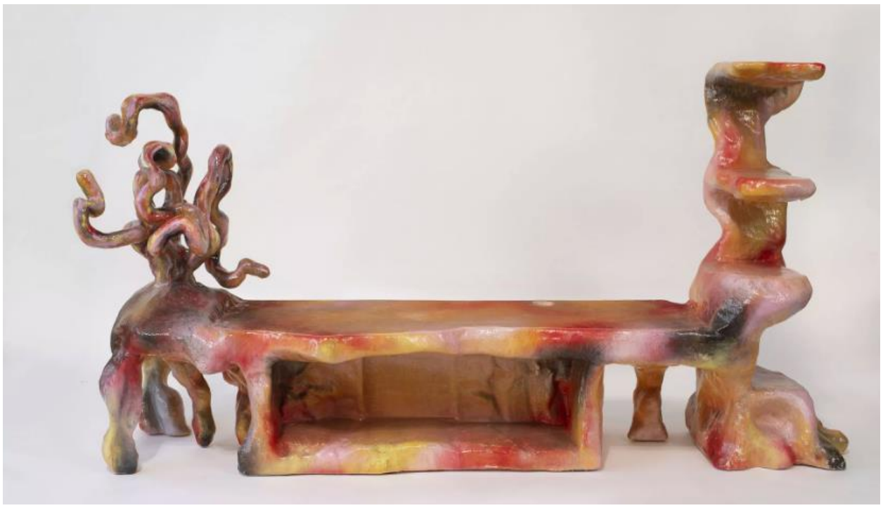
TV stand Morphosis TV Bench, 2020. Styrofoam, fiberglass, polyester resin, paint, spray paint, crayons, varnish

From June 22, 2020, the <u>Friedman Benda</u> New York Gallery will present the first American exhibition of the French-Danish duo <u>OrtaMiklos</u>. OrtaMiklos: 6 Acts of Confinement. The works are divided into 6 separate scenes, representing a different emotional reaction to current events in the world associated with a pandemic, quarantine and an acute sense of uncertainty.