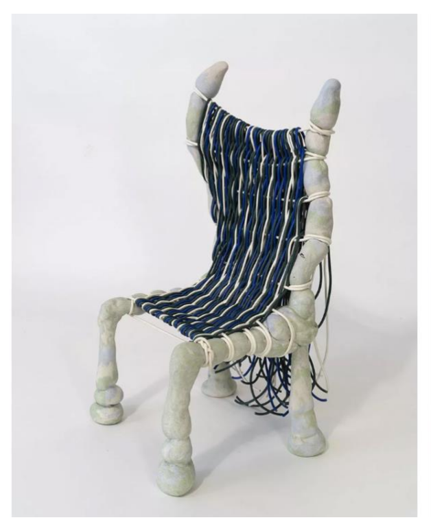
Electric Wave Chair , 2020. Steel, concrete, pigments, fibers, electric cable, varnish