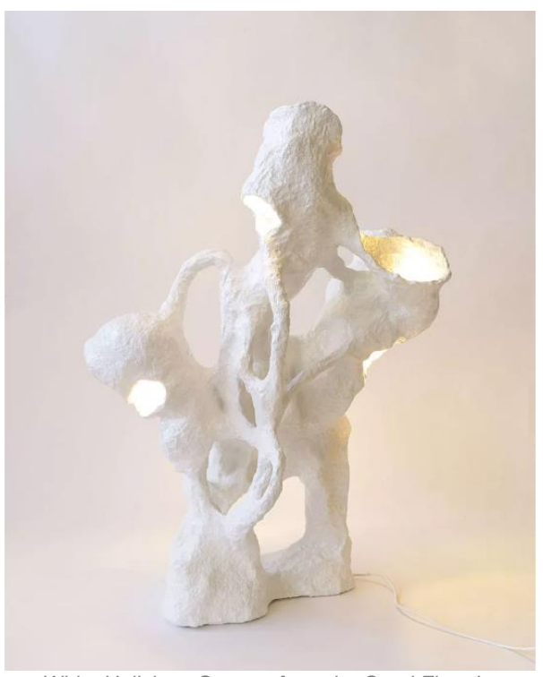
White Haliclona Sponge from the Coral Floor Lamp series, 2020. Metal mesh, steel, wood, cellulose, paint, varnish, lighting fixtures