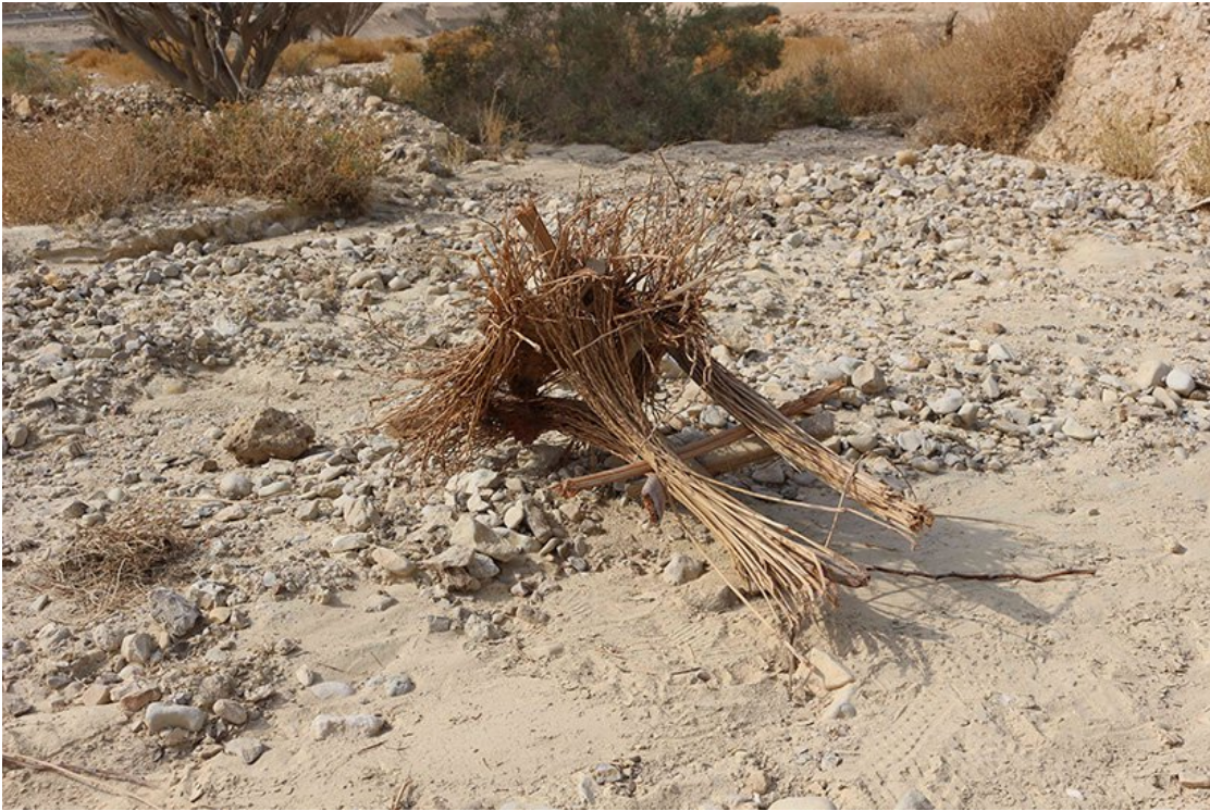
a series of woven containers are polished with a special varnish