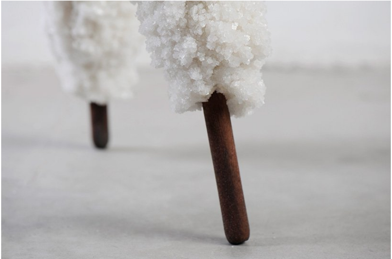
salt crystallizes on the surface of the stool

begins to crystallize on its surface. this dramatic technique gives a new shape and thickness to the stool with a layer of natural salt forming a unique new skin.