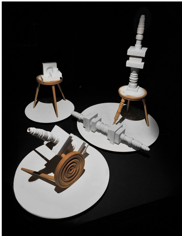
lot's wife is a series of vegan-clay objects