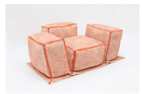
Faye Toogood, Maquette 259 / Canvas and Foam Seat, Rust,

New York, NY (January 18, 2021) - Friedman Benda is pleased to announce the opening of its Pop Up gallery in Miami, Florida, opening January 23 through March 26, 2021. The Pop Up exhibition highlights work from the gallery's decade and a half history, representating both established and emerging designers across five continents. The space will be a platform for contemporary design, showcasing a diverse range of practices, material choices, and conceptual innovation.