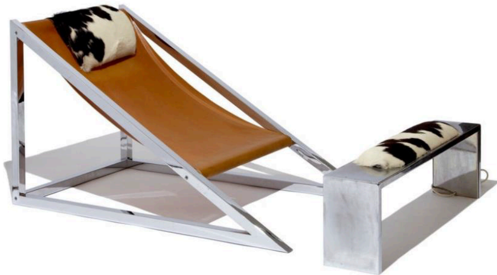
Mies Chair, Archizoom Associati, 1969