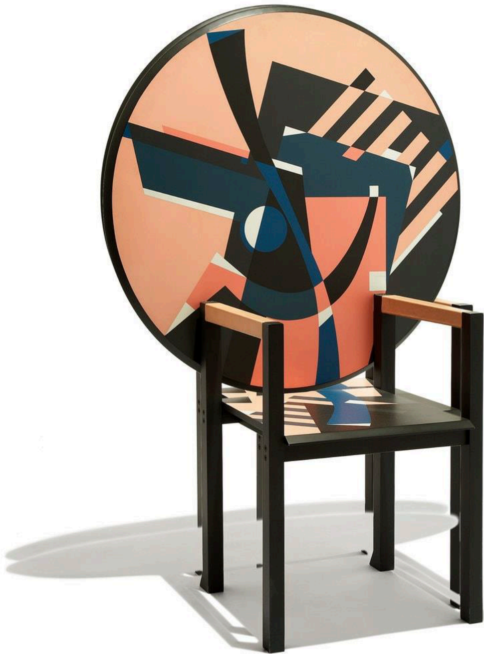
Zabro, Alessandro Mendini, 1984

Alessandro Mendini, who died in 2019, championed Radical design from his position as editor in chief of Casabella. His Zabro design is a more recent work, usually regarded as an example of postmodernism. The round back flips down, transforming the chair into a table.