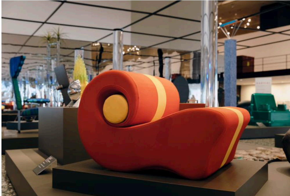
The Chiocciola, or snail, chair followed the Capitello. Individual units could be lined up to create “a never-ending sofa.”

Much of the Radical furniture advanced the idea that you could live anywhere and create your own environment. Inflatables were popular (for seating and also for protest props). And Archizoom created the 1966 Superonda sofa, a pair of lightweight, wave-shaped, configurable puzzle pieces, often photographed outdoors, as if they were part of the landscape.