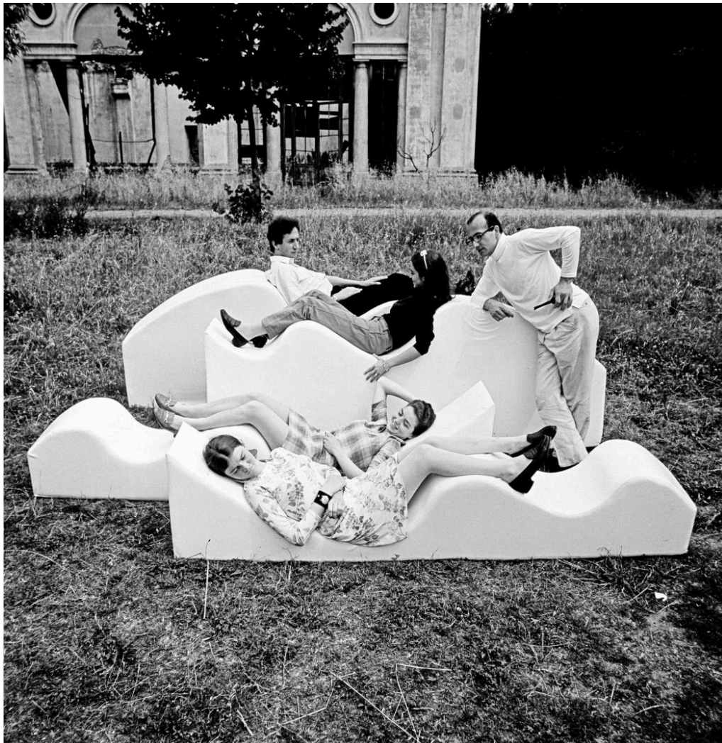
Archizoom's 1966 Superonda sofa, made of two versatile puzzle pieces, could be configured in many ways.