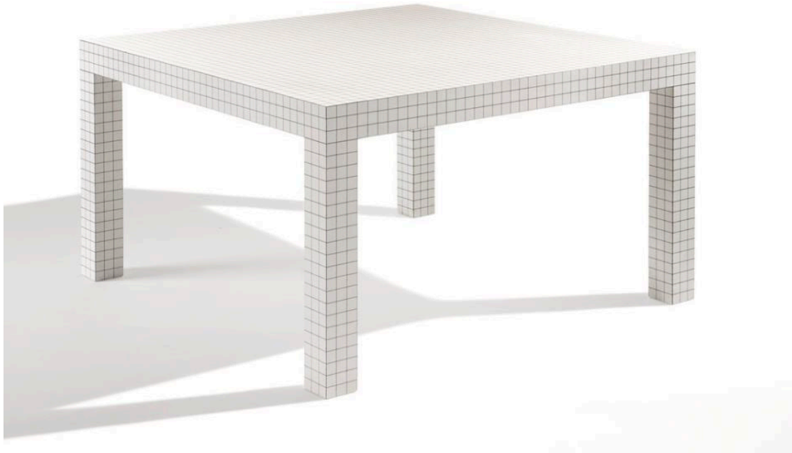
Quaderna 2600, Superstudio, 1970