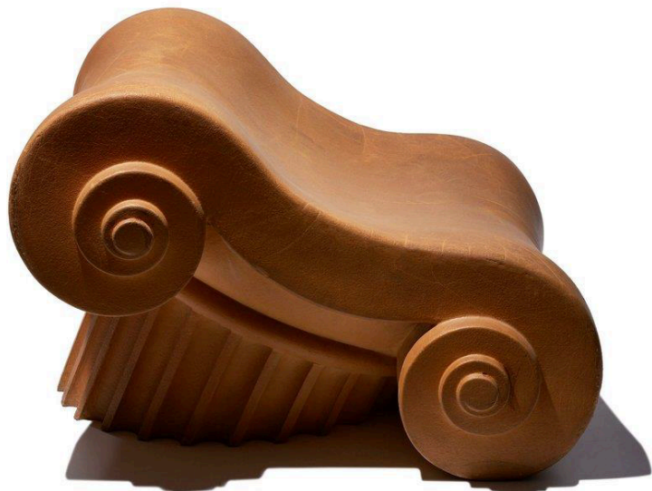
The Capitello, by Studio 65, is a hunk of polyurethane foam shaped like the top of an Ionic column and intended as a lounge chair.