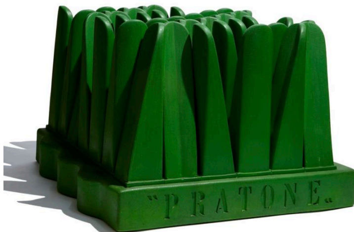
Pratone, Gruppo Strum, 1971

In Italian, the studio initials stand for Association of Totally Integrated Reactionary Designers. Opposed to consumerism and capitalist society, it vowed to make design more democratic. This table lamp was an experiment with low-voltage lights; magnets hold tiny bulbs in place.