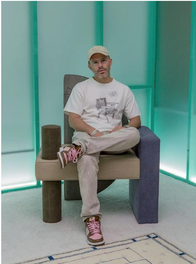
daniel arsham