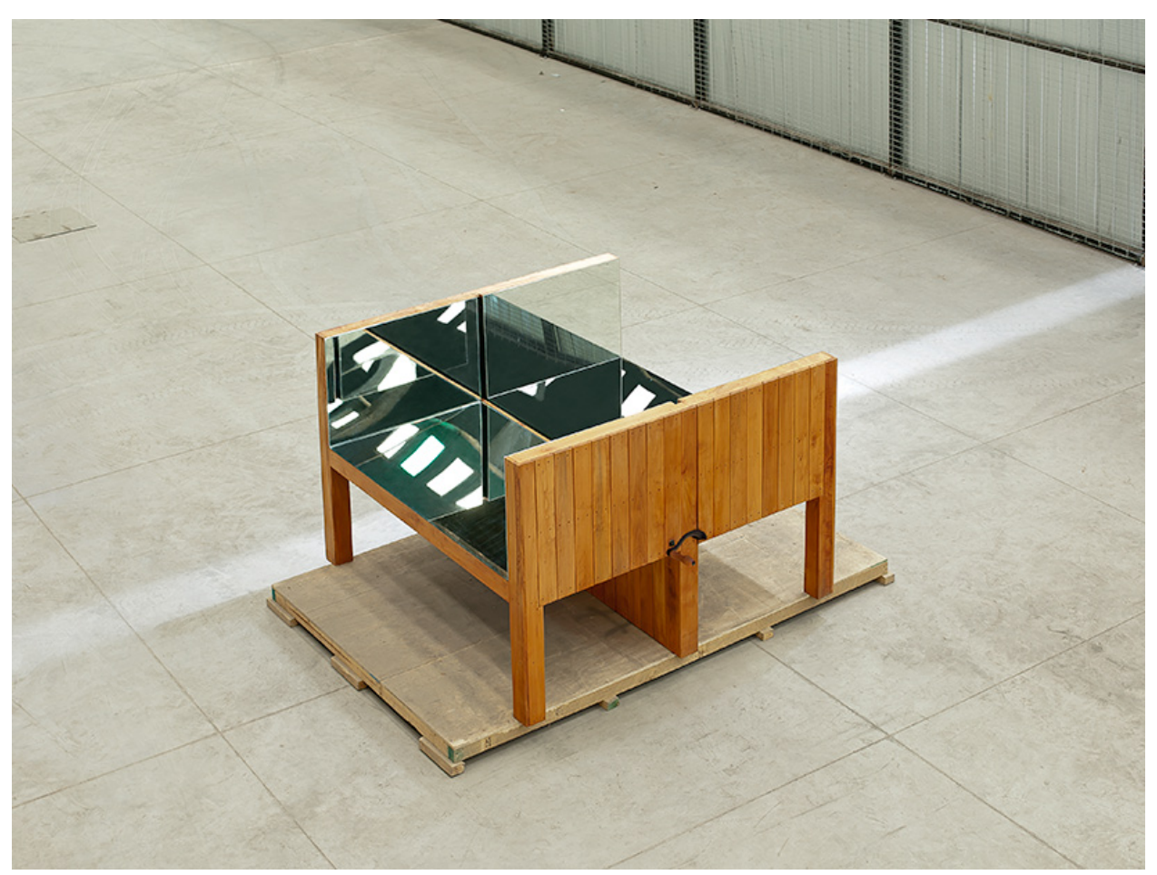
chilean studio pezo von ellrichshausen presents its 'guillotine table'

'this presentation will be a unique opportunity to analyze the relationship between architectural aesthetic and design ethos on a smaller, more intimate scale and investigate various approaches to reconciling interior and exterior spaces, the commercial versus the residential and the private versus the public sphere,' say the exhibit's organizers. both 'inside the walls' and 'nothing' remain on view at friedman benda in new york until February 17, 2018.