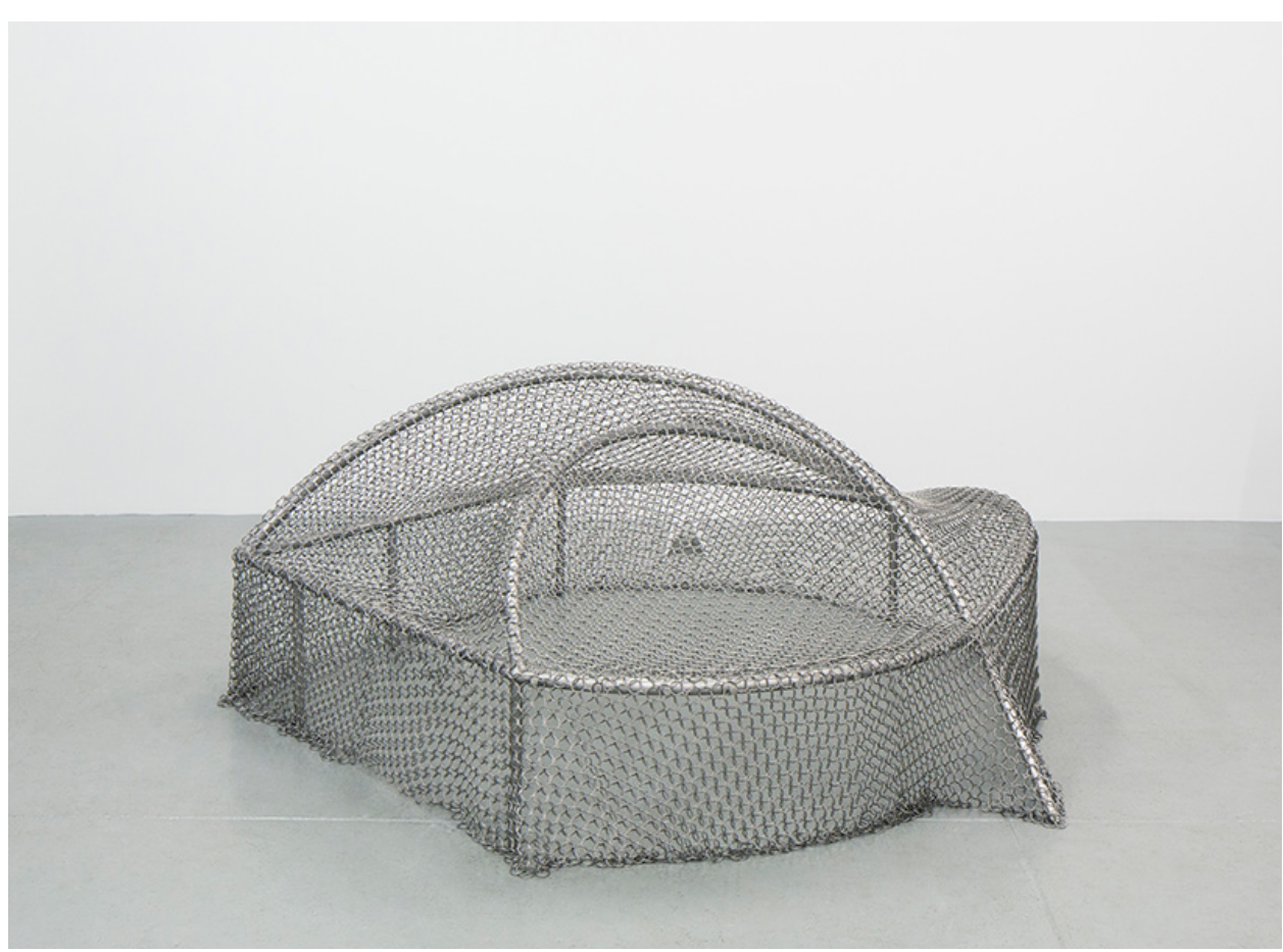
'frame 01' has been designed by new york firm SO-IL