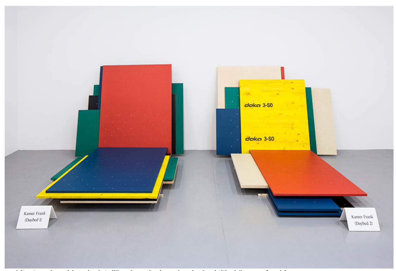
architecten de vylder vinck taillieu has designed a daybed titled 'kamer frank'

also on view within friedman benda's ground floor gallery is 'inside the walls: architects design', a survey of important examples of architect-designed furniture. curated by mark mcdonald, the display features works by lina bo bardi, marcel breuer, charles and ray eames, frank gehry, and frank lloyd wright, among others. drawing on archival photographs of interiors and historical ephemera, 'inside the walls' charts revolutionary developments in architecture and design across the 20th century.