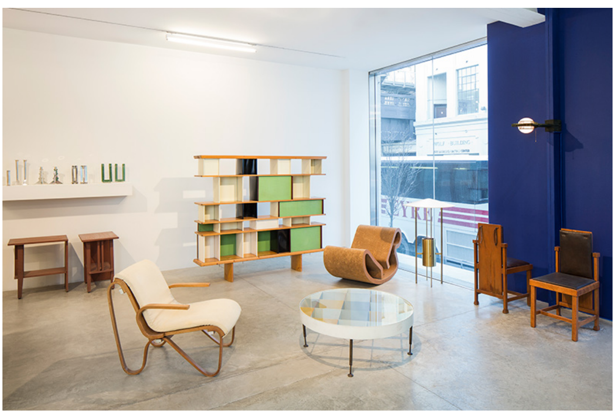
pieces by frank gehry, gio ponti, and mies van der rohe are presented image by daniel kukla, courtesy of friedman benda

the display surveys seminal architect-designed furniture image by daniel kukla, courtesy of friedman benda