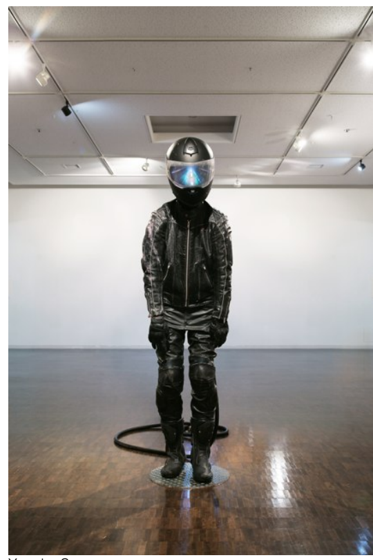
Yusuke Suga Mediator, 2013 Racing suit, helmet, projector system 72 x 19.6 x 27 inches

Elie, the only female member of Chim 1 Pom, has been prohibited from entering the United States ever since a travel companion filled out her visa questionnaire with false answers. The group's work is centered on the conflict between Elie's actual identity versus her fictionalized identity interpreted though a political lens.