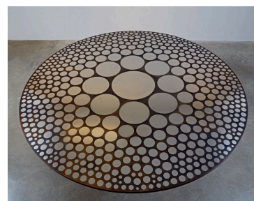
Freeze Multi-Circle Table, 2015

What fascinates me here is that everything constantly expands and contracts, but imperceptibly. Everything from earth and water, to our own bodies and skins, even the universe itself. The pieces that make up Freeze are certainly large, heavy and solid, but that makes it all the more extraordinary that they are simply held up by an invisible join, 'frozen together' by forces we can't even perceive.