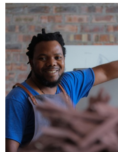
Andile Dyalvane (b. 1978, active in Cape Town, South Africa)