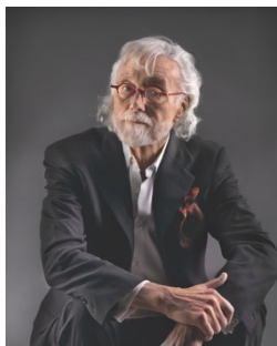
Wendell Castle (b. 1932 in Kansas City; active 1962-2018 in Rochester)