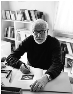
Andrea Branzi (b. 1938, active in Milan, Italy)