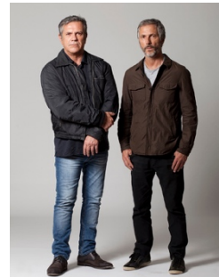
Estudio Campana (est. 1998, active in São Paulo, Brazil)