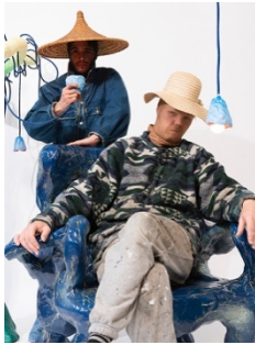
OrtaMiklos (est. 2015, active in Eindhoven, Netherlands and Les Moulins, France)