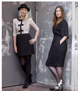
Front Design (est. 2003, active in Stockholm, Sweden)