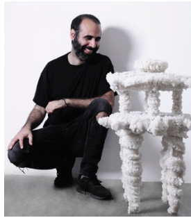
Erez Nevi Pana (b. 1983 in Bnei Brak, Israel; active in Linz, Austria)