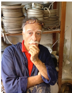
Bruno Gambone (b. 1936, active in Florence, Italy)