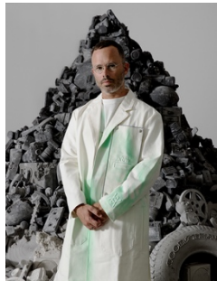
Daniel Arsham (b. 1980, active in New York)