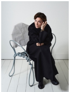
Faye Toogood (b. 1977, active in London, UK)