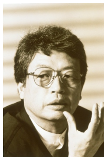
Shiro Kuramata (1934-1991, Tokyo, Japan)