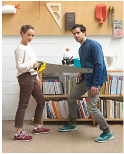
Raw-Edges (est. 2007, active in London, UK)