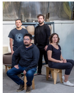
gT2P [Great Things to People] (est. 2009, active in Santiago, Chile)