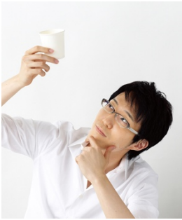
nendo (est. 2002, active in Tokyo, Japan)