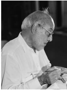
Gaetano Pesce (b. 1939 in La Spezia, Italy; active in New York)