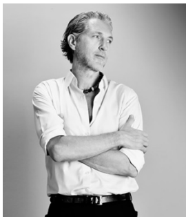
Marcel Wanders (b. 1963, active in Amsterdam, Netherlands)