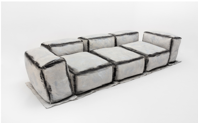
Maquette 234 / Canvas & Foam Sofa

FAYE TOOGOOD ASSEMBLAGE 6: UNLEARNING SEPT 10 – OCT 17 2020