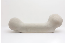
Faye Toogood [British, b. 1977] Maquette 47 / Clay Bench, 2020 Cement composite, road paint 38 x 112.5 x 32 inches 97 x 286 x 81 cm Edition of 1