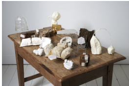
Faye Toogood [British, b. 1977] A6 Maquettes , 2020