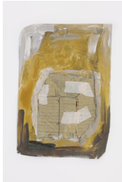
Faye Toogood [British, b. 1977] Maquette 011 / Cardboard Box Tapestry, 2020 Wool, cotton 86.75 x 60.75 inches 220 x 154 cm