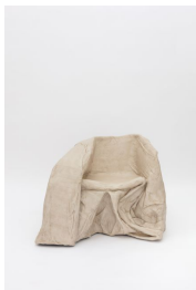
Faye Toogood [British, b. 1977] Maquette 267 / Canvas Chair, 2020 Cast aluminum, acrylic paint 29.5 x 39.25 x 29 inches 75 x 100 x 74 cm Edition of 8