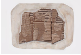
Faye Toogood [British, b. 1977] Maquette 006 / Cardboard Screen Tapestry, 2020 Wool, cotton 67.25 x 96 inches 171 x 244 cm