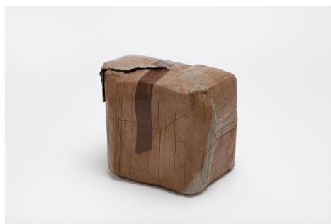
Maquette 16 / Box Stool