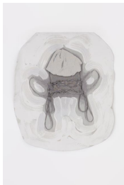
Faye Toogood [British, b. 1977] Maquette 215 / Wire and Card Armchair Tapestry, 2020 Wool, cotton 73.75 x 64.25 inches 187 x 163 cm