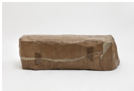
Faye Toogood [British, b. 1977] Maquette 31 / Box Bench, 2020 Cast bronze, acrylic paint 17.75 x 59 x 21.5 inches 45 x 150 x 55 cm Edition of 8