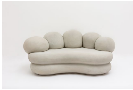
Faye Toogood [British, b. 1977] Maquette 115 / Clay Sofa, 2020 Cement composite, road paint 33.5 x 78.75 x 51.5 inches 85 x 200 x 131 cm Edition of 1