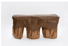
Faye Toogood [British, b. 1977] Maquette 247 / Parcel Tape Console, 2020 Cast aluminum, acrylic paint 34.75 x 63 x 19.75 inches 88 x 160 x 50 cm Edition of 8