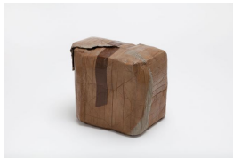
Faye Toogood [British, b. 1977] Maquette 16 / Box Stool, 2020 Cast bronze, acrylic paint 17.75 x 19.75 x 18 inches 45 x 50 x 46 cm Edition of 8