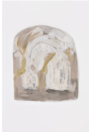
Faye Toogood [British, b. 1977] Maquette 085 / Masking Tape Light 1 Tapestry, 2020 Wool, cotton 67.25 x 57 inches 171 x 145 cm