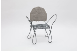
Faye Toogood [British, b. 1977] Maquette 270 / Wire & Card Chair, 2020 Zinc-coated steel, cast aluminum, acrylic paint 39.25 x 37 x 27.5 inches 100 x 94 x 70 cm Edition of 8