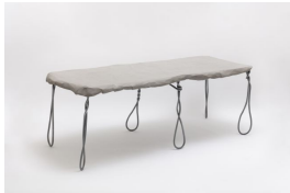
Faye Toogood [British, b. 1977] Maquette 243 / Wire & Card Table, 2020 Zinc-coated steel, cast aluminum, acrylic paint 29.5 x 78.75 x 31.5 inches 75 x 200 x 80 cm Edition of 8