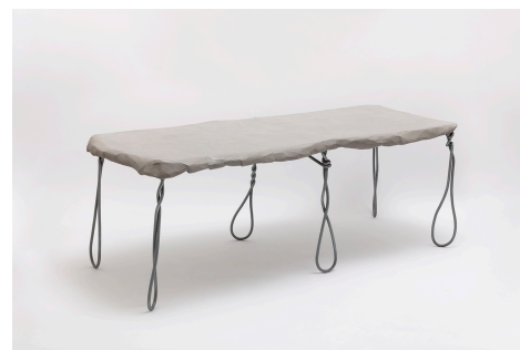
Maquette 243 / Wire & Card Table

Taken as a whole, the collection suggests how deceptive first appearances can be. Trompe-l'oeil effects imitate the twisted wires and taped cardboard of the original models, preserving the creative steps that led to their own genesis even as the true materials of their construction are disguised. The designs suggest the aleatory qualities of folk art or found objects – yet every crinkle and crease has been carefully