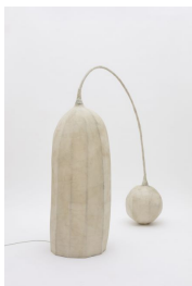
Faye Toogood [British, b. 1977] Maquette 72 / Masking Tape Light, 2020 Stainless steel, resin-coated canvas, LEDs 67 x 39.25 x 27.5 inches 170 x 100 x 70 cm Edition of 8