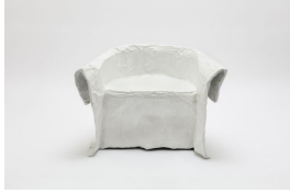
Faye Toogood [British, b. 1977] Maquette 208 / Paper Chair, 2020 Cast aluminum, acrylic paint 29.5 x 43.25 x 27.5 inches 75 x 110 x 70 cm Edition of 8