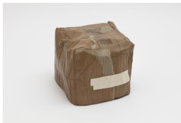
Faye Toogood [British, b. 1977] Maquette 166 / Box Stool, 2020 Cast bronze, acrylic paint 17.75 x 19.75 x 18 inches 45 x 50 x 46 cm Edition of 8