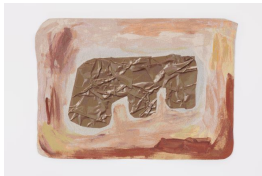
Faye Toogood [British, b. 1977] Maquette 193 / Parcel Tape Console Tapestry, 2020 Wool, cotton 40.25 x 56.75 inches 102 x 144 cm