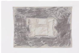
Faye Toogood [British, b. 1977] Maquette 178 / Paper Armchair Tapestry, 2020 Wool, cotton 39 x 55.25 inches 99 x 140 cm