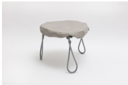
Faye Toogood [British, b. 1977] Maquette 264 / Wire & Card Side Table, 2020 Zinc-coated steel, cast aluminum, acrylic paint 17.75 x 19.75 x 21.75 inches 45 x 50 x 55 cm Edition of 8