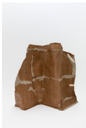
Faye Toogood [British, b. 1977] Maquette 60 / Box Screen, 2020 Cast aluminum, acrylic paint 63 x 63 x 27.5 inches 160 x 160 x 70 cm Edition of 8