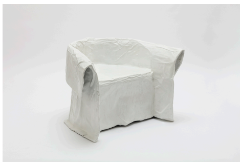
Maquette 208 / Paper Chair

encountered in childhood fables. The playful qualities of rough-hewn maquettes, broken up by the corrugations of crumpled paper and masking tape, are recast at functional scale – daybeds, chairs and consoles, manufactured in cast bronze, wrought iron and rough canvas.