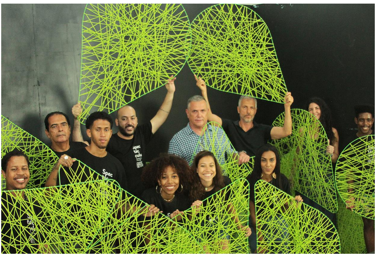
Campana Brothers and the Spetaculu team who helped with the exhibition installation