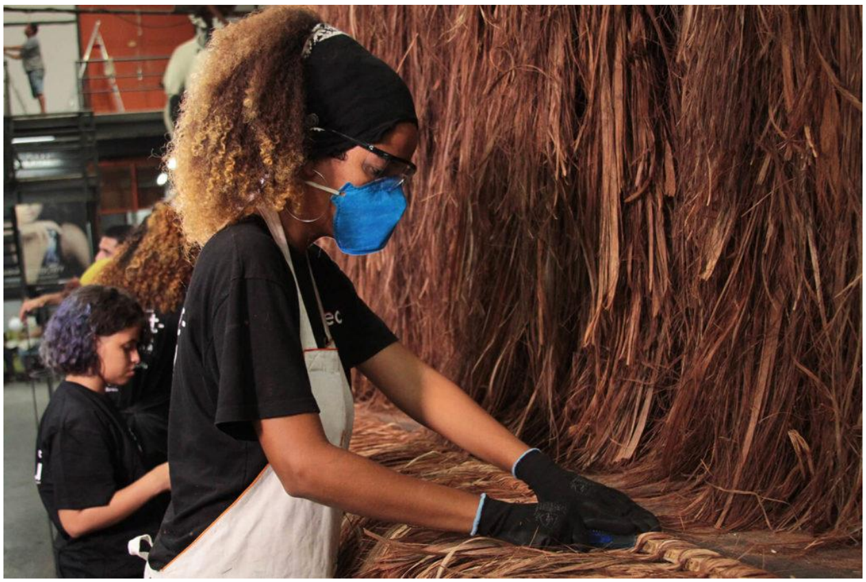
Spetaculu members working on a piassava column

British Museum! It is our cultural heritage! We want to draw attention to the need to protect and preserve that heritage.