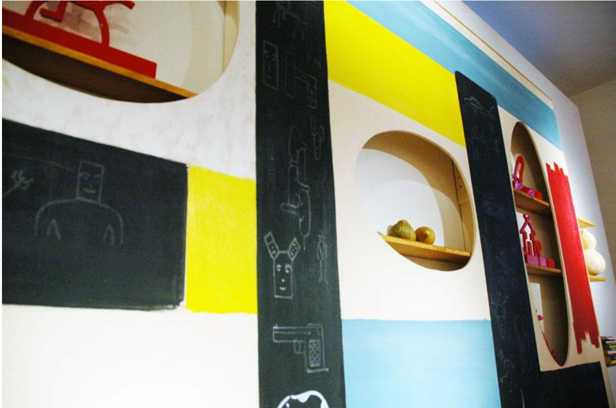
'figure 5'.

milano as part of milan design week 2011 'contaminate the unduly self-referential language of design and desecrate the untouchability of art' by creating not only a series of small hand painted sculptural forms but also a series of wall hanging paintings with shelves built into them.