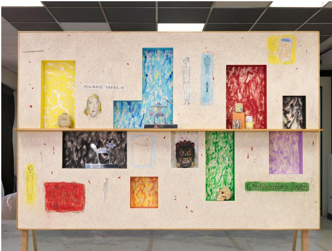
'figure 2'.