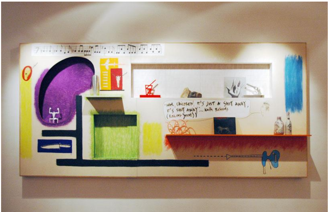
'figure 3'.

"Andrea Branzi: figurine + dida at design gallery milano," designboom , April 14, 2011.