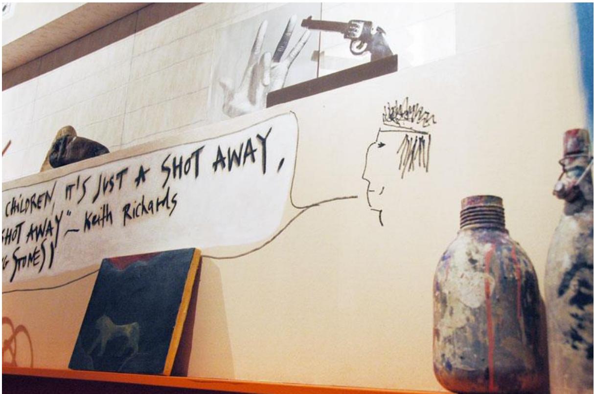
detail. image © designboom

"Andrea Branzi: figurine + dida at design gallery milano," designboom , April 14, 2011.