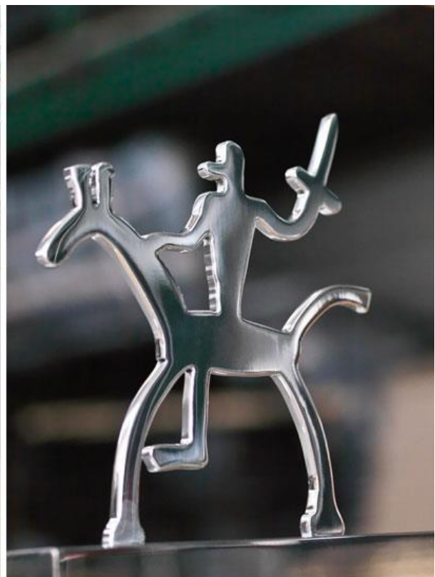
figurines. images courtesy of ruy teixeir

“Andrea Branzi: figurine + dida at design gallery milano,” designboom , April 14, 2011.