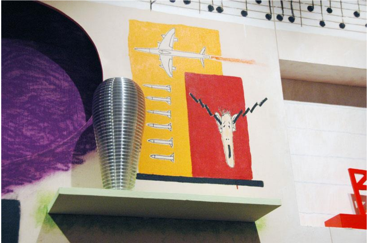
detail of 'figure 3'.